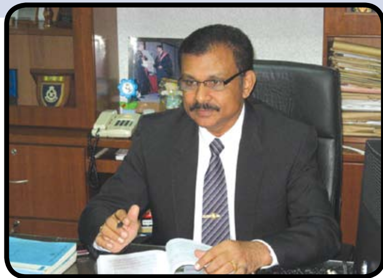
Tanjong Malim to Parit Buntar.

The service is free. However, clients are urged to contribute travelling expenses if they can afford, as Perak is huge and the courts span from