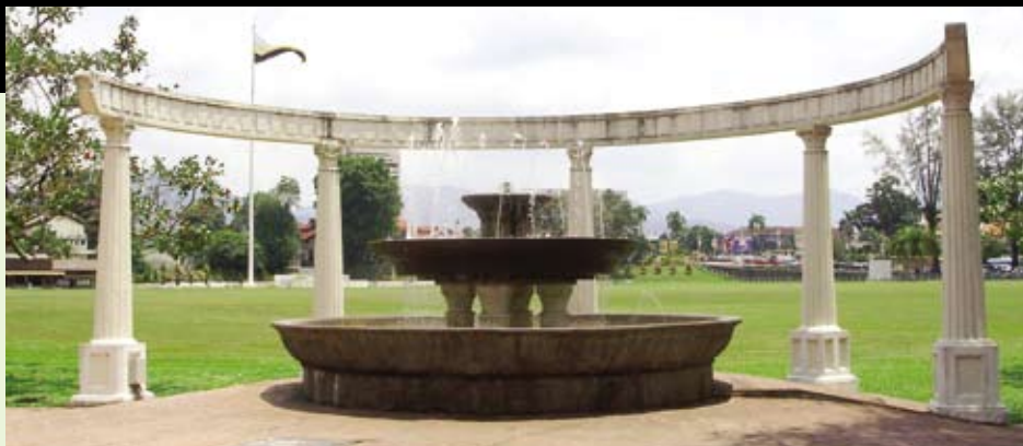
Fountain at the edge of Ipoh Padang in need of some scrubbing

impressive structure “fronted by a beautiful floral garden which serves as a charming welcome for tourists”. This garden which is right in the middle of the “Heritage Walk” being promoted in the city and also the location of Pokok Ipoh ( antiaris toxicaria ) from which the city got its name, was fondly referred to as ‘a mini garden of Taj Mahal’. Today I wonder if it still serves as a ‘charming welcome’ for tourists as the area reeks of neglect.