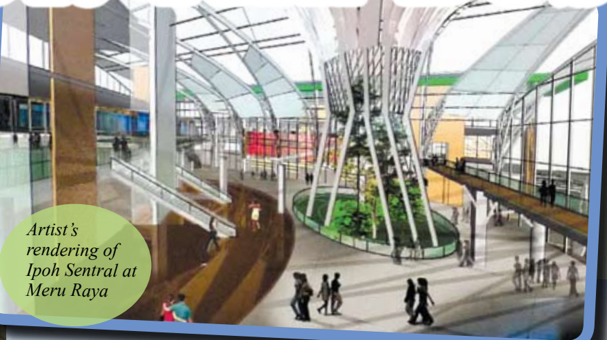
Artist's rendering of Ipoh Sentral at Meru Raya