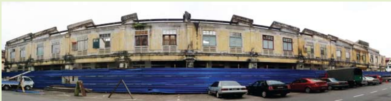
Demolished. The block of townhouses on Jalan Chung On Siew

I poh and the Kinta Valley are in danger of losing its branding and outstanding universal value as a Tin-Mining UNESCO World Heritage Site.