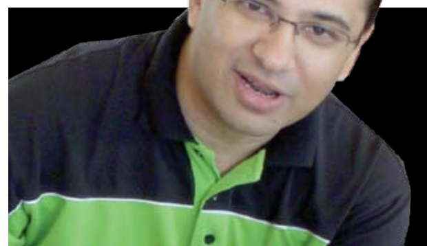
mentoring kids in welfare homes.

He also plans to work with the Welfare Department on