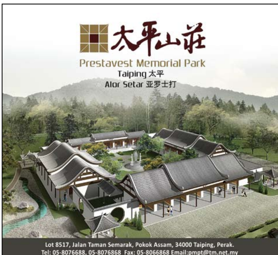
Lot 8517, Jalan Taman Semarak, Pokok Assam, 34000 Taiping, Perak. Tel: 05-8076688, 05-8076868 Fax: 05-8066868 Email: pmpt@tm.net.my

Send request with IC details, proof of family income to: scholarship@ipohecho.com.my