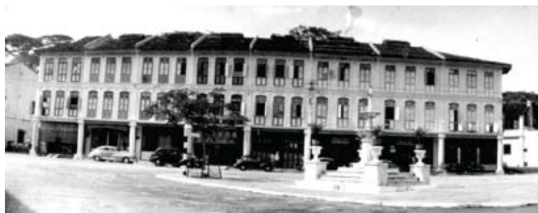
1947 The E W Birch Memorial Fountain

Finally Little India came into view complete with its brand new toilet