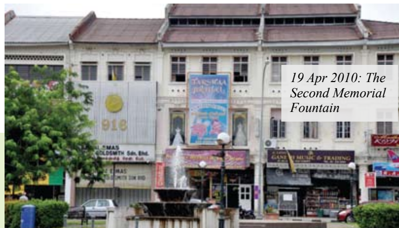
Today: the new 'fountain'???