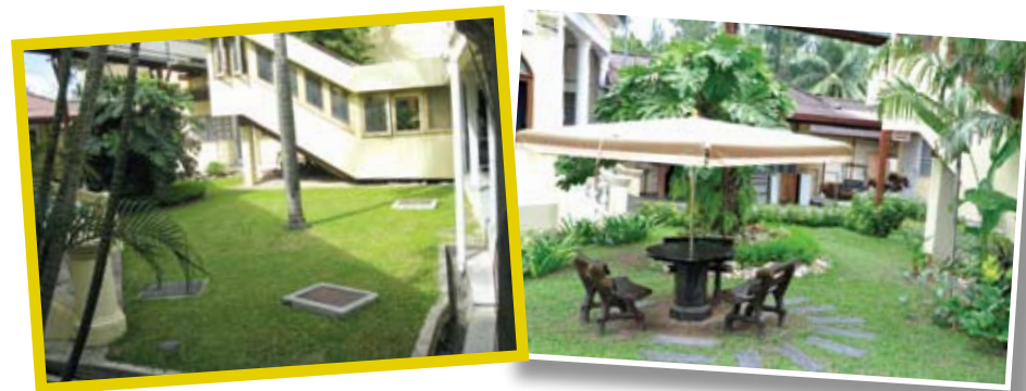
Mini garden – before (left) and after

This grand old lady looks set to step into the 21 st century.