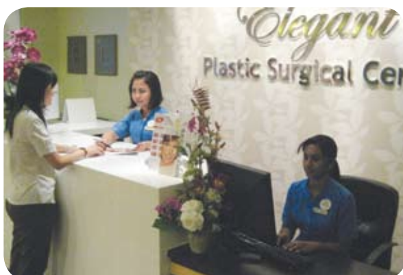
PHI's new plastic surgical centre