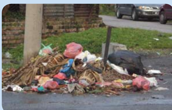
Lebuh Simee 2