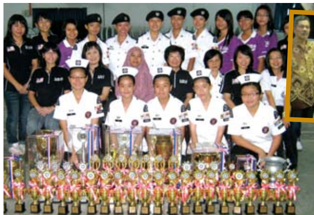
Ave Maria Convent

On Sunday, April 25, a total of 17 teams from Ipoh, Taiping and Teluk Intan, partook in the 54 th Annual First Aid and Nursing Competition organised by St John Ambulance of Malaysia (Perak Chapter) with the