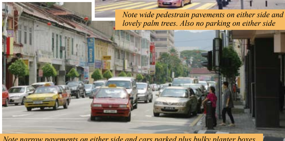
Note narrow pavements on either side and cars parked plus bulky planter boxes

crossing between the Old and New Town sectors is not planned and facilitated for pedestrians.