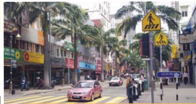
Note wide pedestrian pavements on either side and lovely palm trees. Also no parking on either side

Jalan Bukit Bintang KL In contrast to Jalan Sultan Idris Shah, Ipoh.