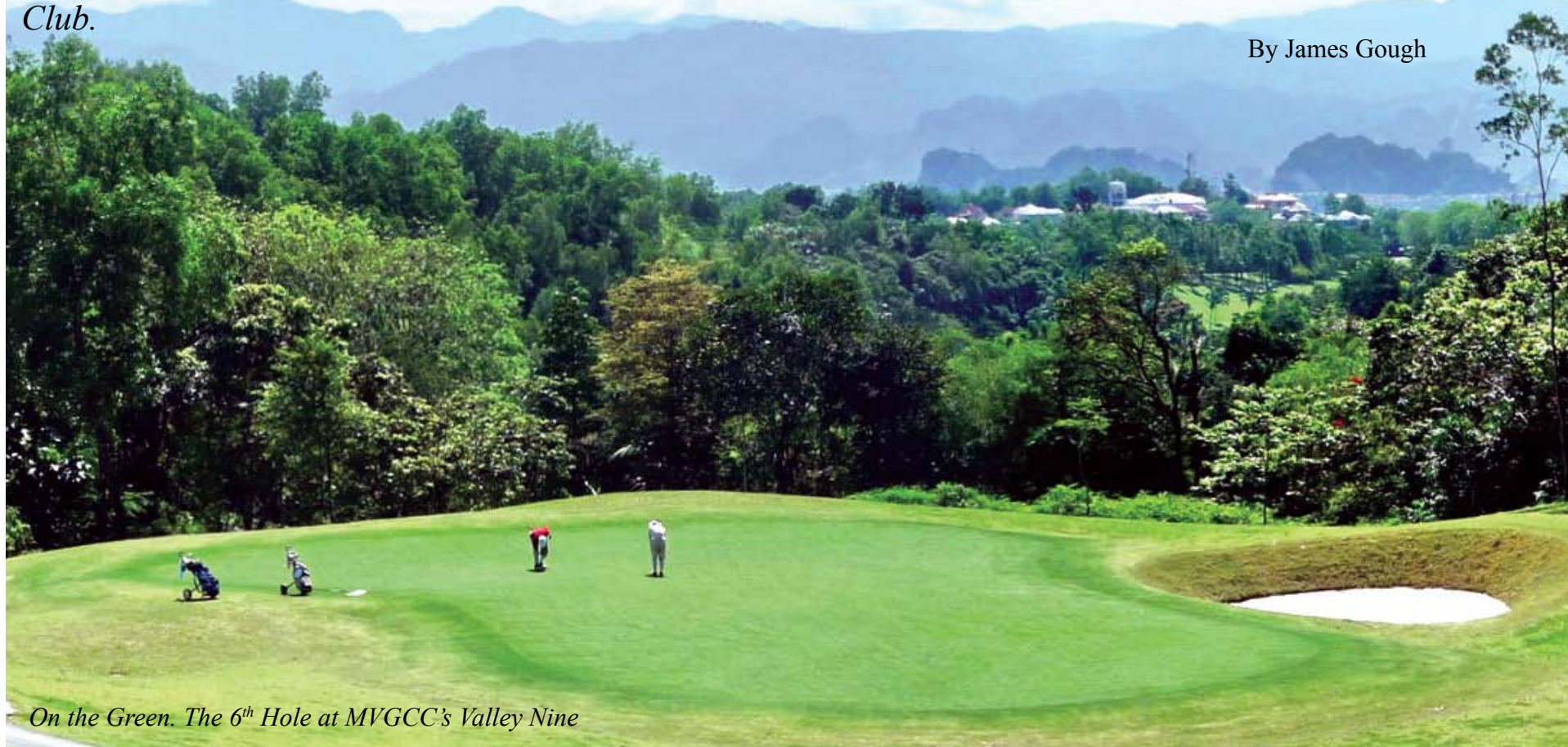
On the Green. The 6 th Hole at MVGCC's Valley Nine