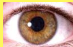
Open Angle & Normal Tension Glaucoma eye looks normal, no obvious symptoms

PRIMARY OPEN ANGLE GLAUCOMA – presents silently, most common. Open Angle & Normal Tension Glaucoma: eye looks normal, no obvious symptoms