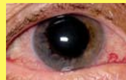
Angle Closure Glaucoma red eye, dilated pupil

This type of glaucoma is also known as acute glaucoma or narrow angle glaucoma. It is not as common as open angle glaucoma. In this type of glaucoma, the eye pressure usually rises quickly resulting in acute symptoms of eye pain, redness, photophobia (inability to tolerate light), headache and sometimes even vomiting. The patient is usually forced to seek immediate treatment from an eye doctor who has to lower the eye pressure. The eye pressure in this kind of glaucoma is usually very high and the patient is in pain.