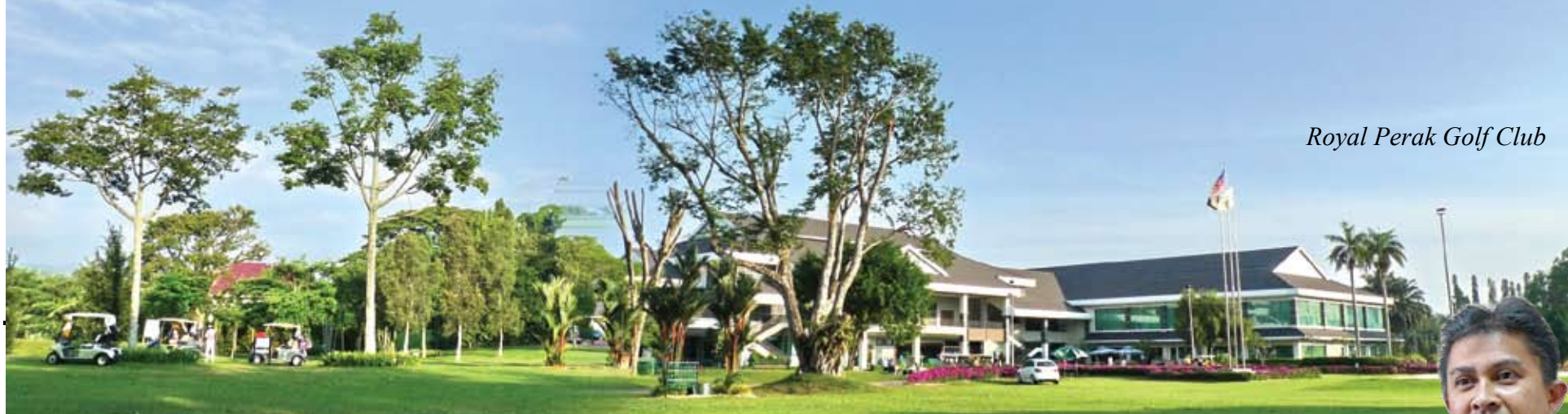
Royal Perak Golf Club

Acknowledging that golf in the state has positive potential, he added that a meeting with the stakeholders and local tour agents will be held soon to initiate a structured golf package. “The package won’t just focus on Ipoh but other clubs at Lumut and Taiping and must cater to all. In Ipoh we have good food but we must also consider shopping for the wife and theme park activities for the family. The package too must target the foreign and domestic golfers.”