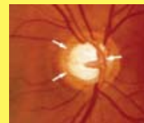
Optic nerve damage in glaucoma

The picture on the right shows the damage that occurs to the optic nerve or optic disc due to glaucoma (indicated by the arrows).