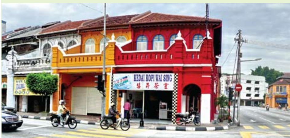
Two units of the planned 'rainbow' shop lots