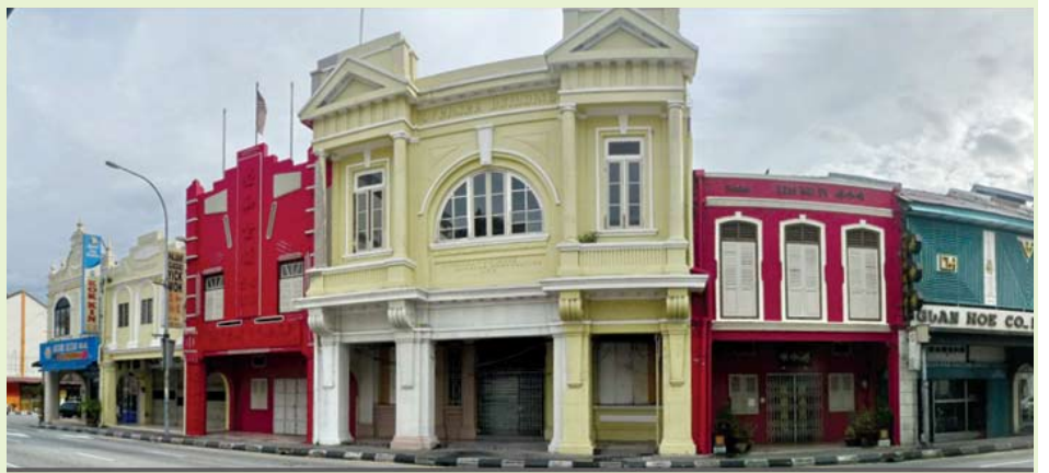
Oversea Building (in yellow), Lim Ko Pi on the right

One of the reasons he purchased 10-16 Hugh Low Street is because the Oversea