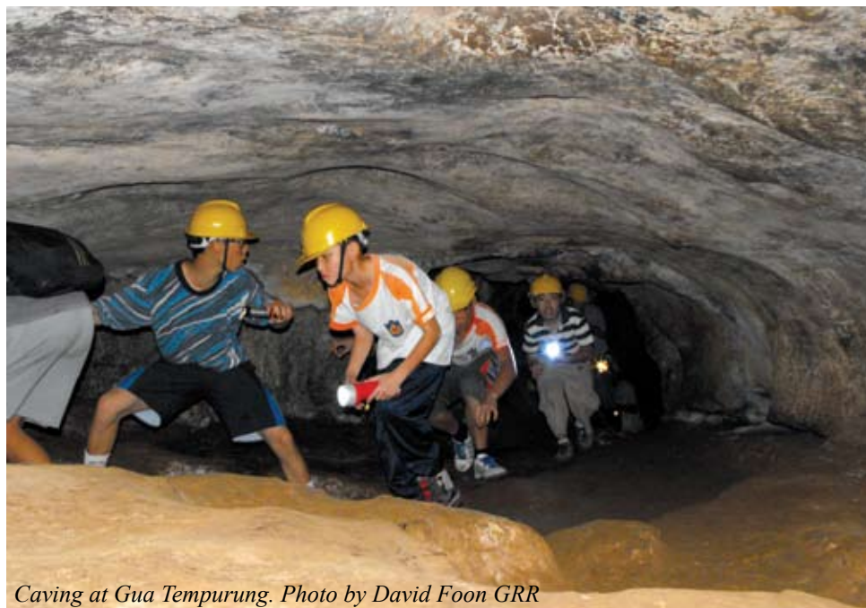
Caving at Gua Tempurung.

Undoubtedly, offering activity-packed eco-adventure outings can be the start of more customers coming from non-traditional markets. Could it be that the eco-adventure tourist has gotten wind of what Perak has to offer in the way of a quality adventure? Time will tell.