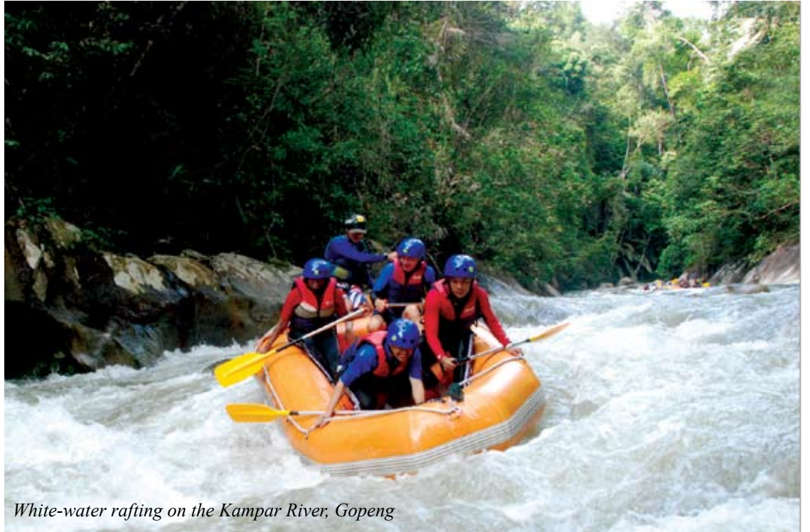
White-water rafting on the Kampar River, Gopeng

With the growth of eco-tourism, eco-tourist resorts and adventure operators have