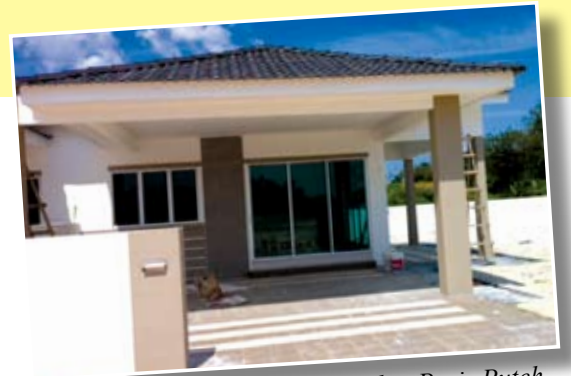
Tumbuh Merata's project at Jalan Pasir Puteh

“The fact that the price of housing in Perak is much laggard from Peninsular Malaysia pricing, it would be fair to infer that there is no element of a property bubble subsisting in Perak,” he said.