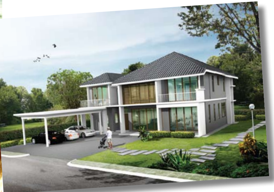
Kinta Real Estate development