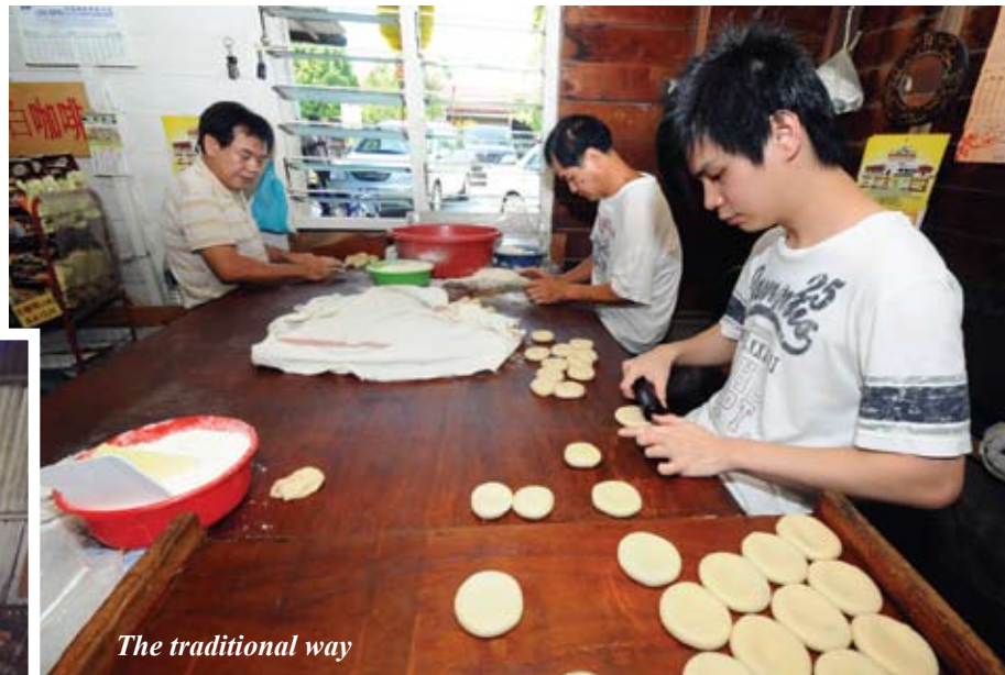
The traditional way

2007 marked a new milestone for Yee Hup when the production shifted into its new factory, a 31,500 square feet facility in the vicinity of the old house where Michelle's father used to sweat over the hot ovens. To preserve their heritage and to cater to customers who prefer to buy the original "Hiong Piah", production still continues at the old house using the traditional lard for the biscuits and coconut husks for charcoal. This manual