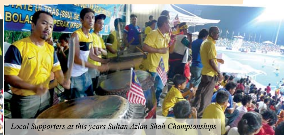
Local Supporters at this years Sultan Azlan Shah Championships