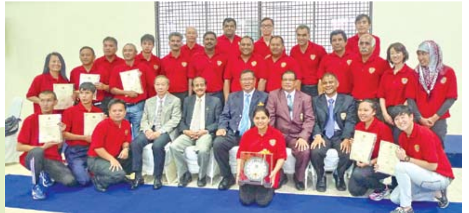
Asian hockey officials

Stadium Azlan Shah, built in 1984 to Olympic standards, is the permanent venue of the Sultan Azlan Shah Cup. It has a