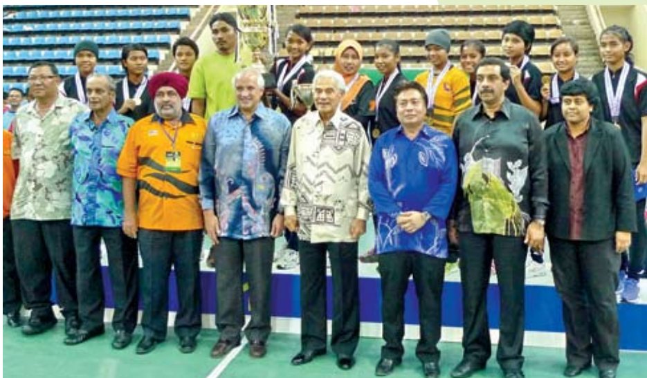
Malacca won the Womens Indoor Hockey tournament this year.

In 1975, at the Hockey World Cup tournament held in Kuala Lumpur, Malaysia emerged 4th after they were beaten by Germany, ranking them as 4th best in the world after India, Pakistan and West Germany. Subsequently, in the Junior World Cup held in Paris in 1979 and again in 1982 in Kuala Lumpur, Malaysia was ranked 4th in both events.