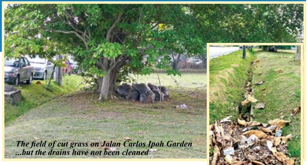
The field of cut grass on Jalan Carlos Ipoh Garden ...but the drains have not been cleaned