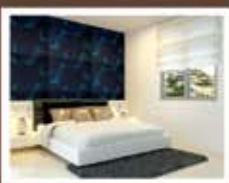
Show home illustrations