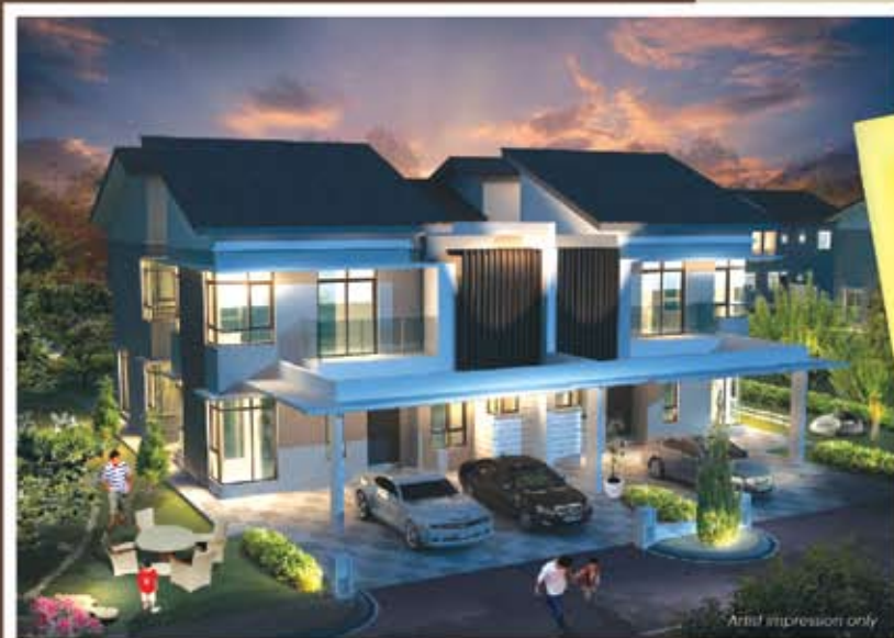
Artistic impression only