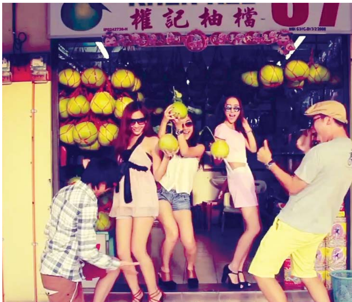
Bimbotic mockery of Pomelos in Parody by Ipoh Lang Productions

A t 3am on a Sunday morning, after clubbing at shoulder packed S.O.S. Club, Digital DJ (Ipoh's most celebrated DJ) and I sat at Nasi Vanggey, Greentown, pondering the demographics of clubbing in Ipoh. Seven days a week, the club is full of people with a minimum of 500 on ordinary days and on weekends S.O.S. is fully booked out. Throughout Malaysia, you can't find a club with 100 people on a Sunday night let alone packed to overflowing. S.O.S however, has at least 500 people on a Sunday night. It raises questions, like "Are Ipoh's youth/young adults, that into alcohol and loud music?" Or is there something else?