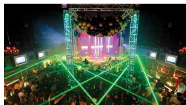
Sensation Of Sound (S.O.S) Club with Digi'Tal DJ