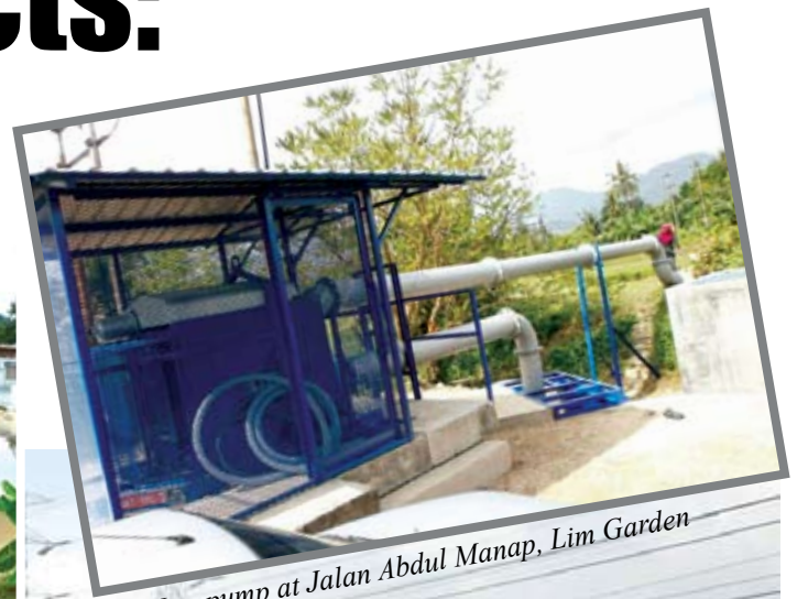
New pump at Jalan Abdul Manap, Lim Garden