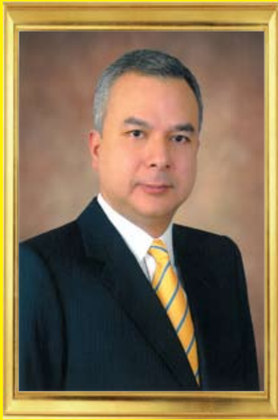
HIS ROYAL HIGHNESS RAJA DR. NAZRIN SHAH IBNI SULTAN AZLAN MUHIBBUDDIN SHAH D.K., D.K.S.A., D.K.A., D.K.II (Selangor), S.P.C.M., S.P.T.S., S.P.M.P. (Perlis), Ph.D (Harvard) THE REGENT OF PERAK