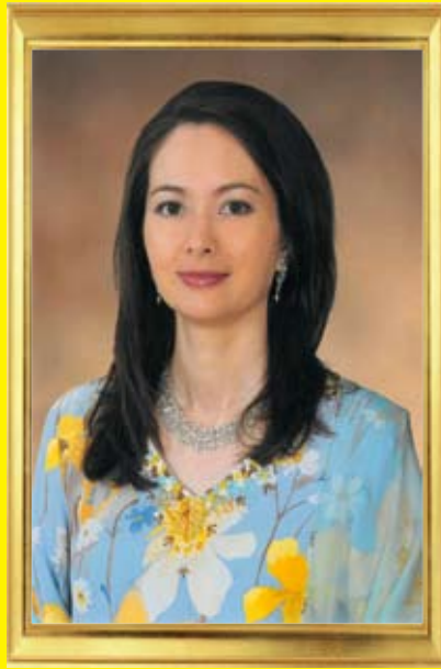
HER ROYAL HIGHNESS TUANKU ZARA SALIM D.K.S.A., D.K.A. THE RAJA PUAN BESAR OF PERAK

The Haven Lakeside Residences • T: +60-1700-8-1700-0 • E: sales@thehaven.com.my • W: www.thehaven.com.my