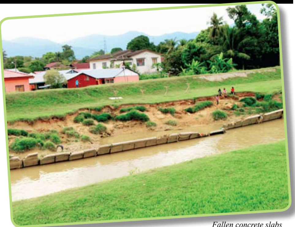
Fallen concrete slabs