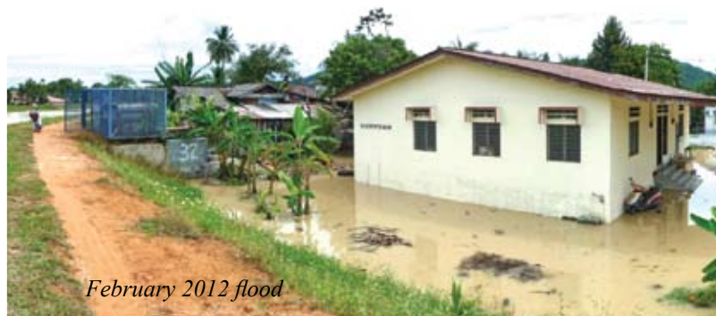
February 2012 flood