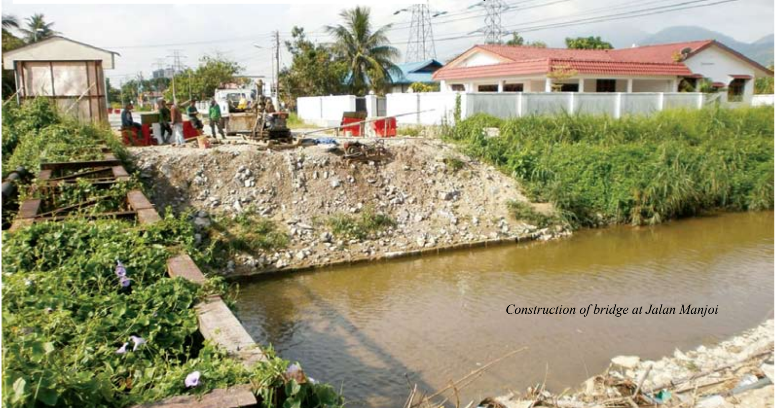
Construction of bridge at Jalan Manjoi