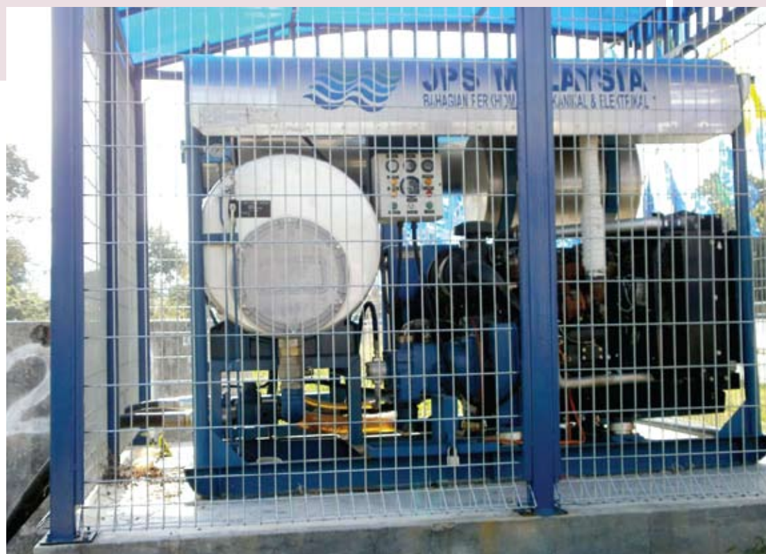
Pumps at entrance to Gugusan Manjoi

Let us hope that these measures would be effective in preventing flooding and that the residents can live in peace.