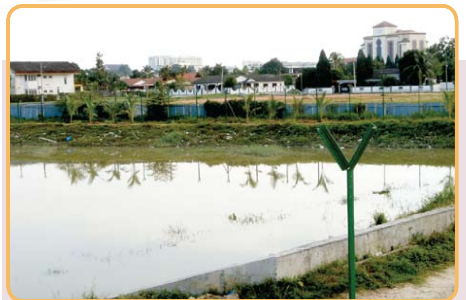
Retention pond in Merdeka Garden