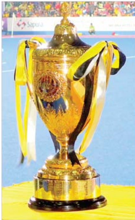
Sultan Azlan Shah Cup

The final match, as with all the earlier games, was fast and exciting. The Malaysian team this year played with a new found vitality. They took the challenge seriously and fans were on the edge for the entire 70 minutes of each match. This was unlike before as the tempo would