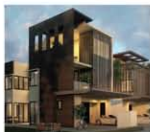
Linked Villas - Zephyr