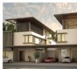
Linked Villas - Vista