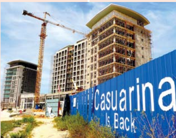
Upcoming Casuarina Hotel at Meru Raya

This network initiative ultimately benefits the customer in terms of seamless service while at the same time contributing towards a harmonious hotel industry