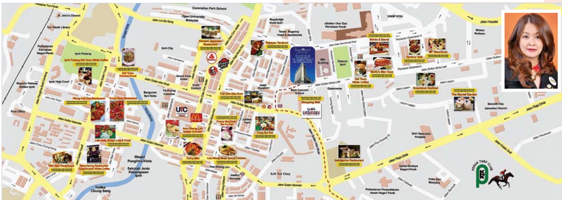
Syuen Hotel's map of popular food outlets. Inset: Syuen Director Ong