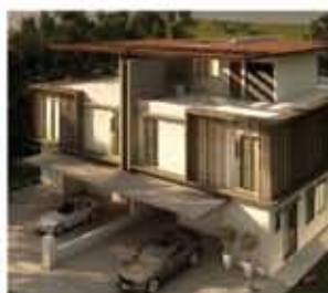
Twin Villas - Astral