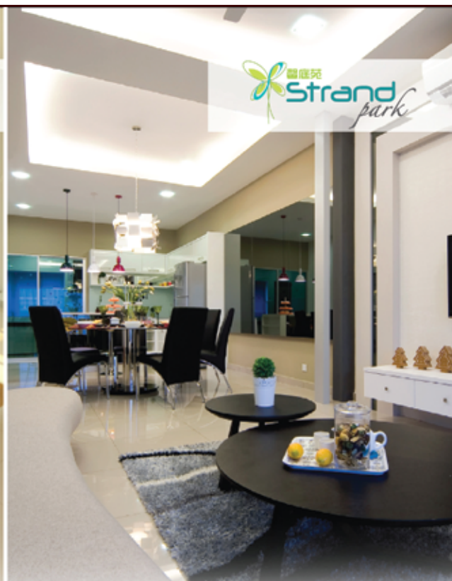
蘭庭苑 Strand park