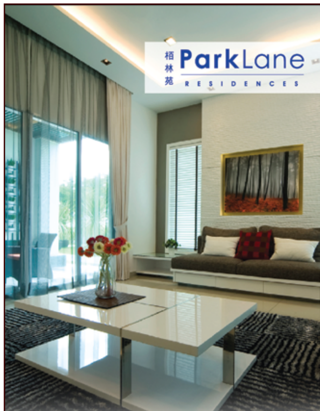
梧林苑 ParkLane RESIDENCES