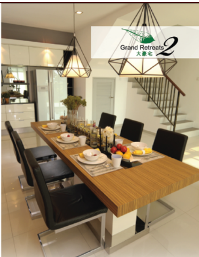
Grand Retreats 2 大豪宅