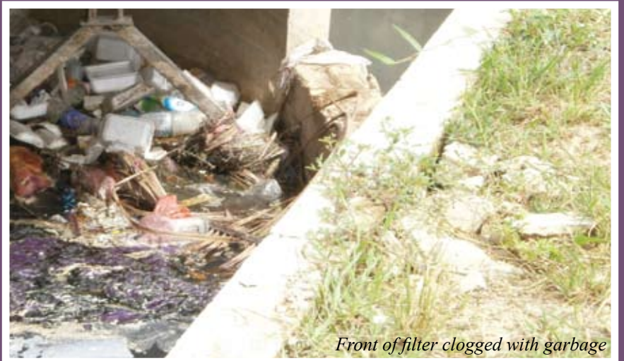
Front of filter clogged with garbage

Constructing the retention pond to prevent flooding during the rainy season is good, but it must be maintained; if not it would become an eyesore.