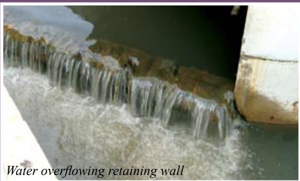
Water overflowing retaining wall

W hen I first saw clean filtered water flowing through the holes in the retaining wall into the new retention pond in Merdeka Garden, I thought it was an ingenious design. However, a few