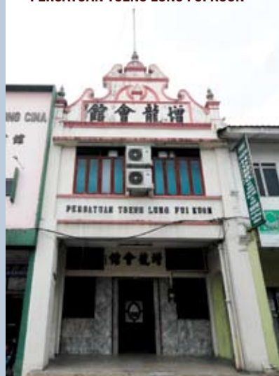
PERSATUAN TSENG LUNG FUI KUON