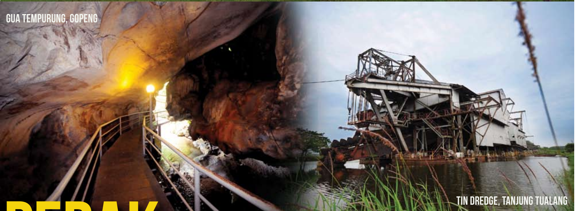
GUA TEMPURUNG, GOPENG