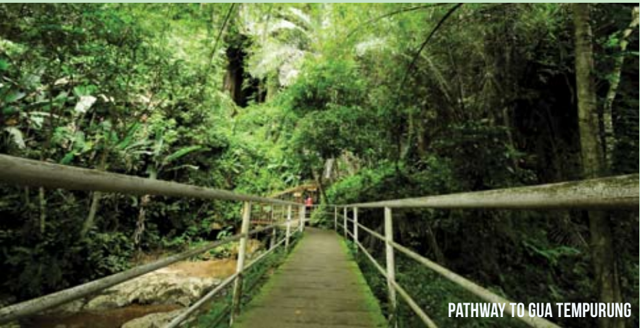
PATHWAY TO GUA TEMPURUNG

Gua Tempurung is open from 9am to 5pm daily, with a break from 12.30pm to 2.30pm on Fridays. The management reserves the right to delay, postpone or cancel the tour in the event of adverse weather conditions, floods, etc. For further information, contact: 019-543 7192 (Abdul Manan).