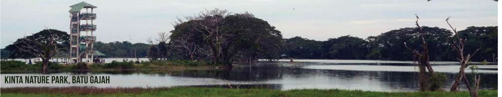
KINTA NATURE PARK, BATU GAJAH