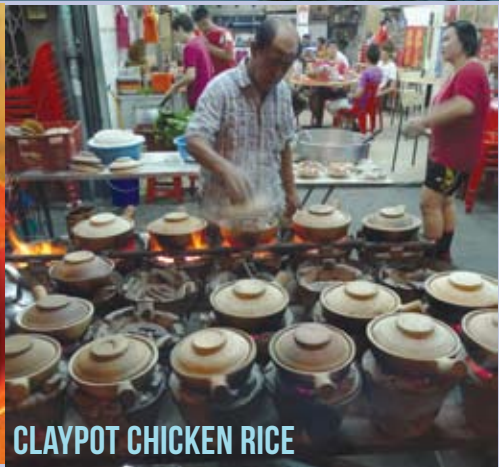
CLAYPOT CHICKEN RICE