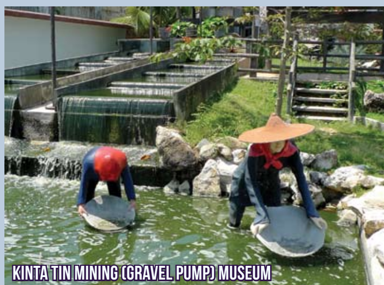
KINTA TIN MINING (GRAVEL PUMP) MUSEUM

Drop by the many clan houses and associations like Tseng Lung Fui Kuon for a visit, and check out the “Kampar Old Temple” which is a Goddess of Mercy Chinese temple built on its present premises in 1904.