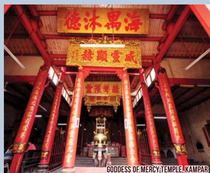
GODDESS OF MERCY TEMPLE, KAMPAR