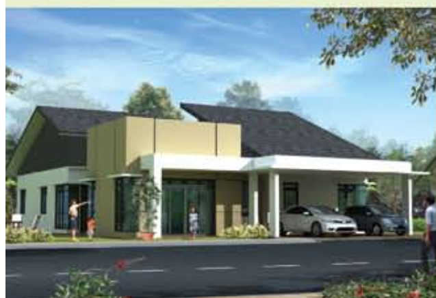
Aster 1-Storey Detached Homes Lot Size : 70' X 90'

Your Safe & Serene Guarded Neighbourhood