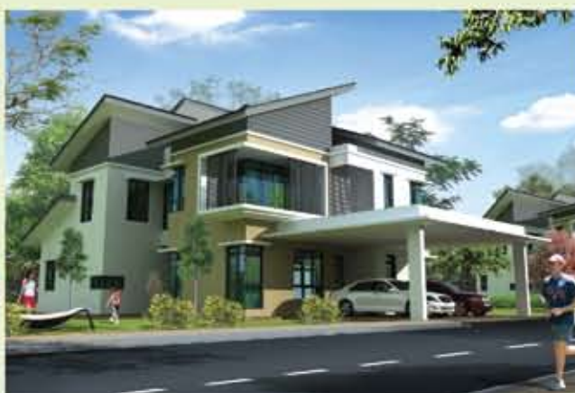
Amber 2-Storey Detached Homes Lot Size : 70' X 90'