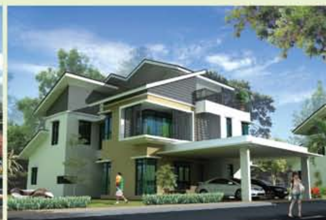
Alder 2½-Storey Detached Homes Lot Size : 70' X 90'

* 5% discount for bumiputera on bumiputera lot