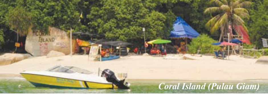
Coral Island (Pulau Giam)