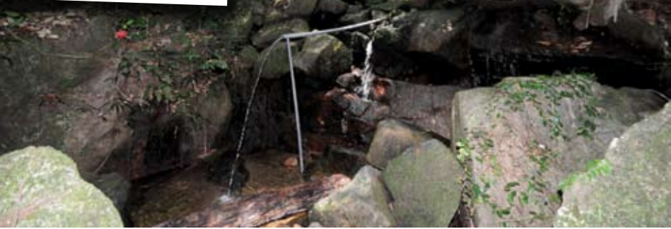
Teluk Nipah mini waterfall