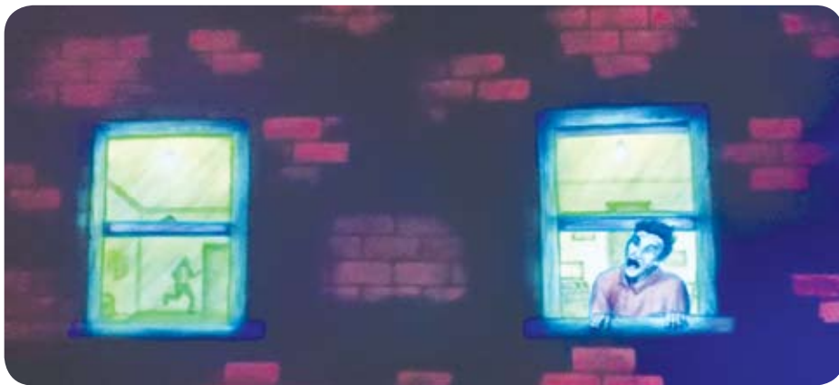
UV painted zombies at Laser Battle

base. Getting shot in the process will also bring them back to square one.