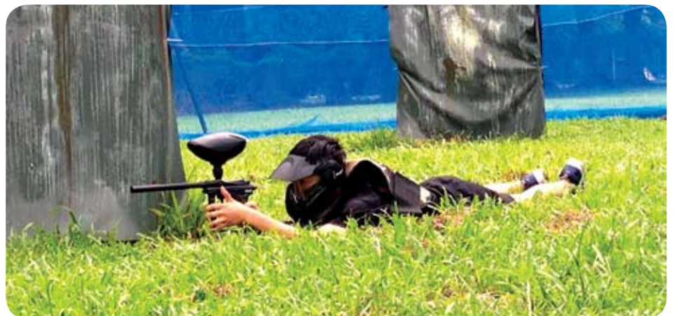
A paintballer taking cover as he patiently waits and hunts down his enemies in the paintball field at YMCA

one of their target markets is the corporate market for team-building activities. The themed rooms are Kidnapped, Detective-X, Pirate Ship and Crazy Lab.