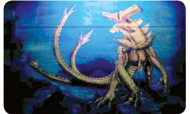
3-D art drawn on the walls in the war zone of Laser Battle

Break The Code is located at Greentown Square and has been open since January 2014. There are currently four themed rooms available with the 5th one on the way and