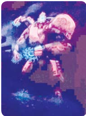
The 3 arm robot on the wall: The Crimson Typhoon art from the movie Pacific Rim at Laser Battle