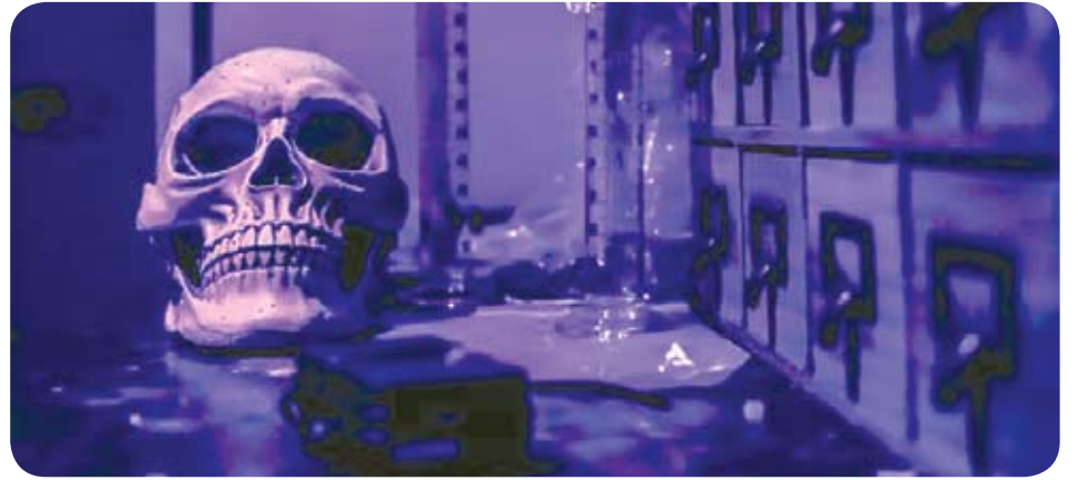
Clues displayed on the table in a game from Break The Code

Break the Code originated from Japan and is widely spread all across Asia. This game is an intuitive, unique, interactive experience that you can never find by reading and online gaming. This game is for those who like answering riddles, solving complex puzzles or are just looking for a challenge. Teams are required to find mysterious clues based on various story lines to solve live puzzles and ultimately escape the room within a time limit. Players are encouraged to work together as a team to solve puzzles collaboratively and the Game Master directs gameplay to add a touch of drama to the story. What is unique about the game is that you will have to imagine yourself physically part of the story.