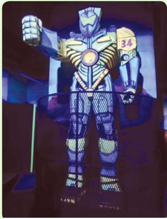
3D Gipsy Danger statue from the movie Pacific Rim displayed in Laser Battle

Zone Collector shoots their enemies, collects points and brings them back to their