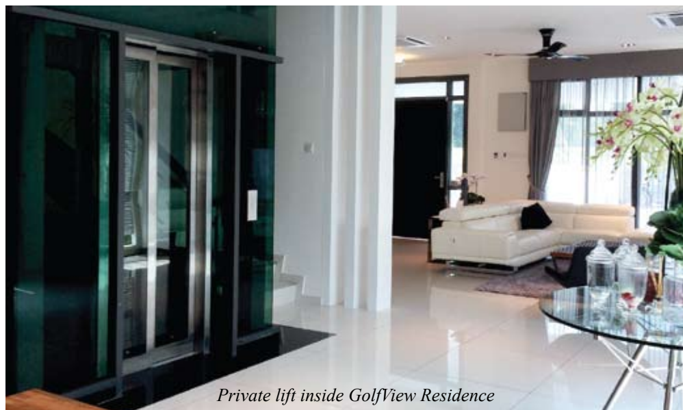
Private lift inside GolfView Residence