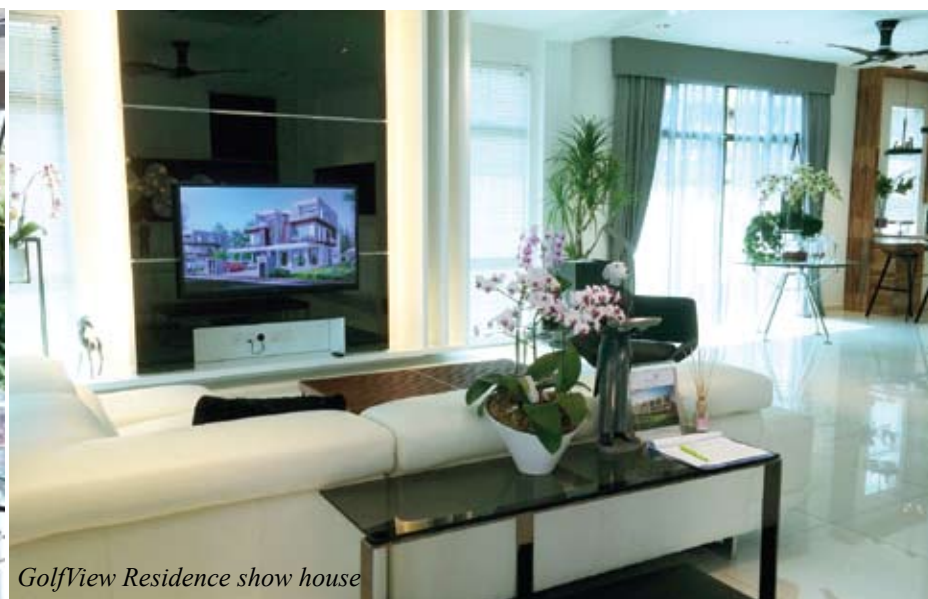
GolfView Residence show house