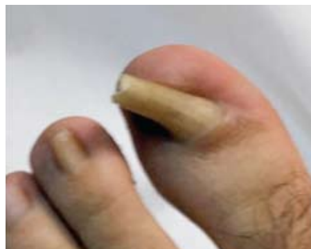
Extremely rolled nail