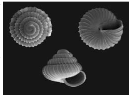
Kanthan Charopa kanthanensis crop res.

So the future of this hill and its flora and fauna are in the hands of LaFarge. Currently LaFarge have made no comment on the name choice for this new snail.