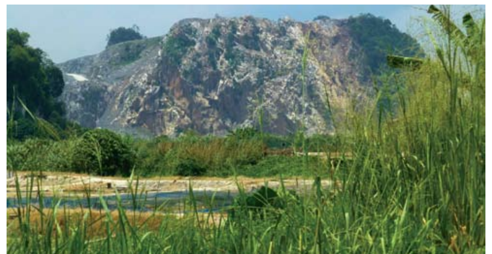
Kanthan quarried side