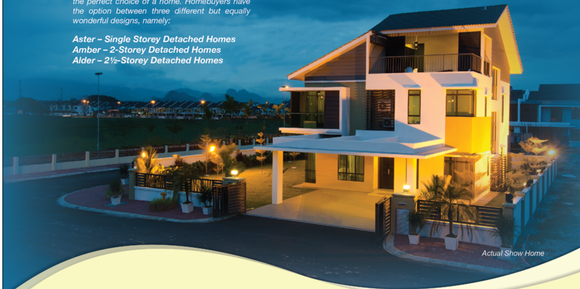
Actual Show Home

Aster – Single Storey Detached Homes Amber – 2-Storey Detached Homes Alder – 2½-Storey Detached Homes