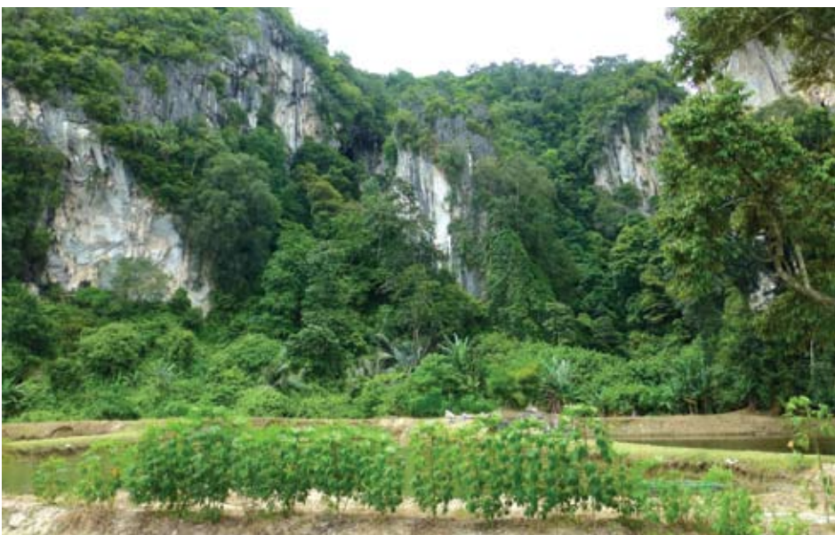
Kanthan untouched side

A new species of snail has been discovered on a hill in the Kinta Valley in Perak. The snail shell was found on Gunung Kanthan, one of the major hills in the Ipoh area. The snail has been named Charopa lafargei and was given this name due to the fact that LaFarge are quarrying the limestone hill.