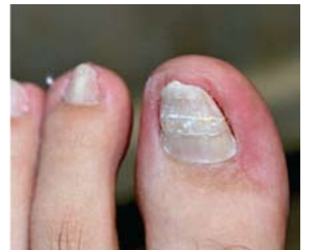
After 12 months, using 13 B/S-braces

A new technology is helping people with ingrown toenails relieve their suffering without having to resort to surgery. Called the B/S-brace Classic, the nail correction kit was developed in Germany as an alternative therapy concept for the gentle yet highly efficient treatment of ingrown toenails.