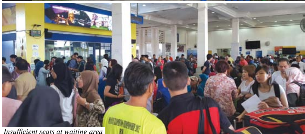
Insufficient seats at waiting area