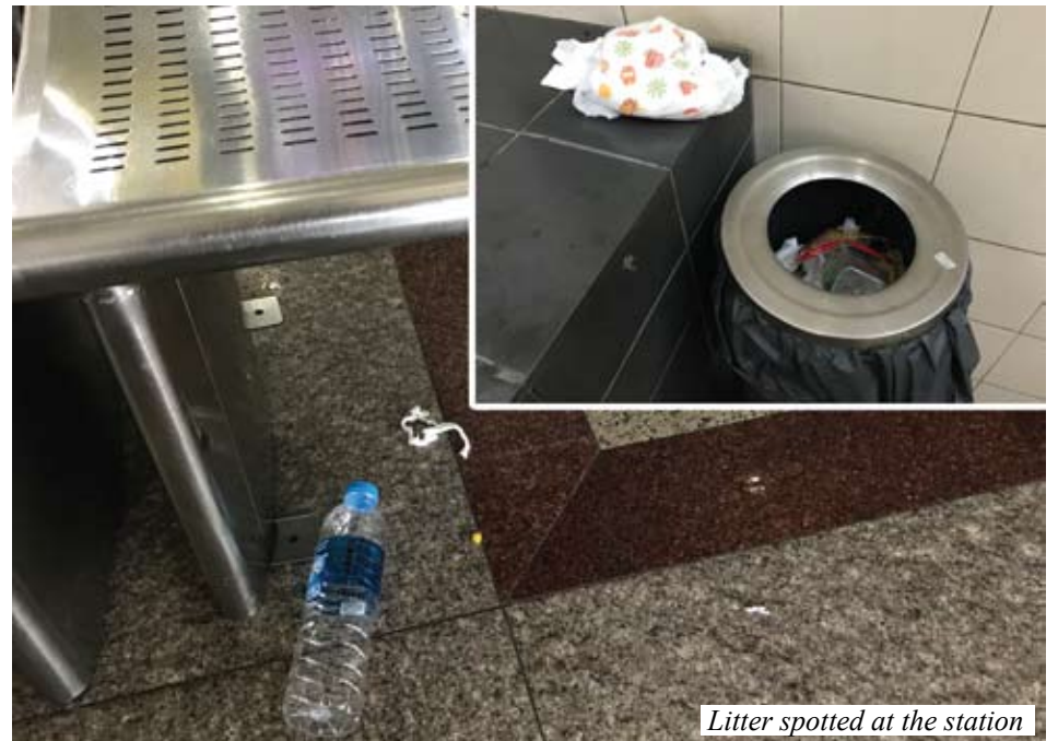
Litter spotted at the station

down so I couldn't buy my ticket online. Even the digital numbering system was not working. We had to queue and the line stretched to the station entrance."