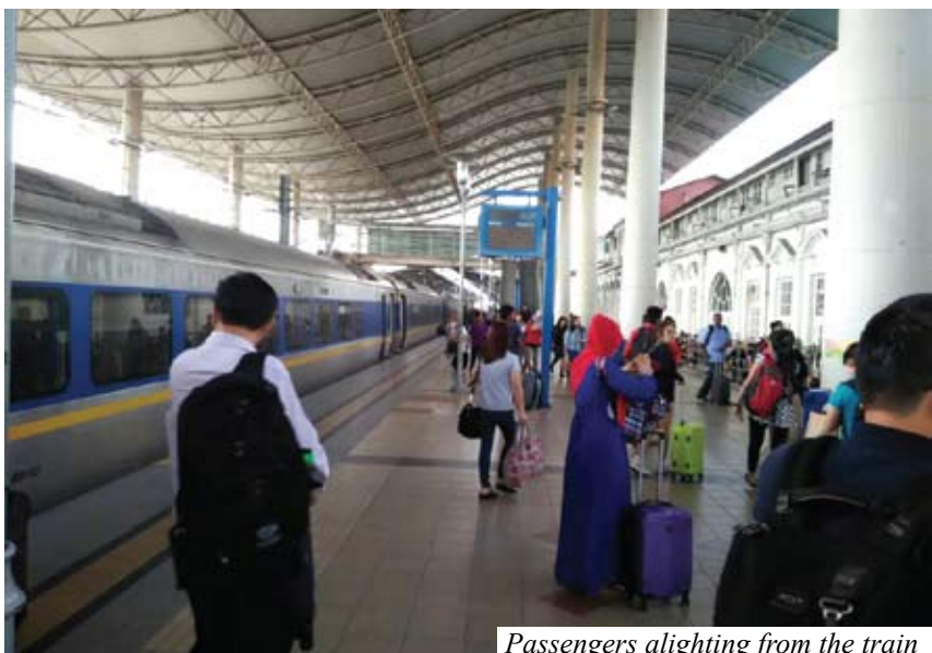
Passengers alighting from the train