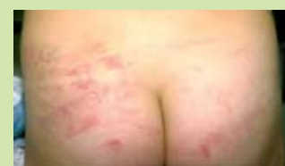
Bruises inflicted by a belt