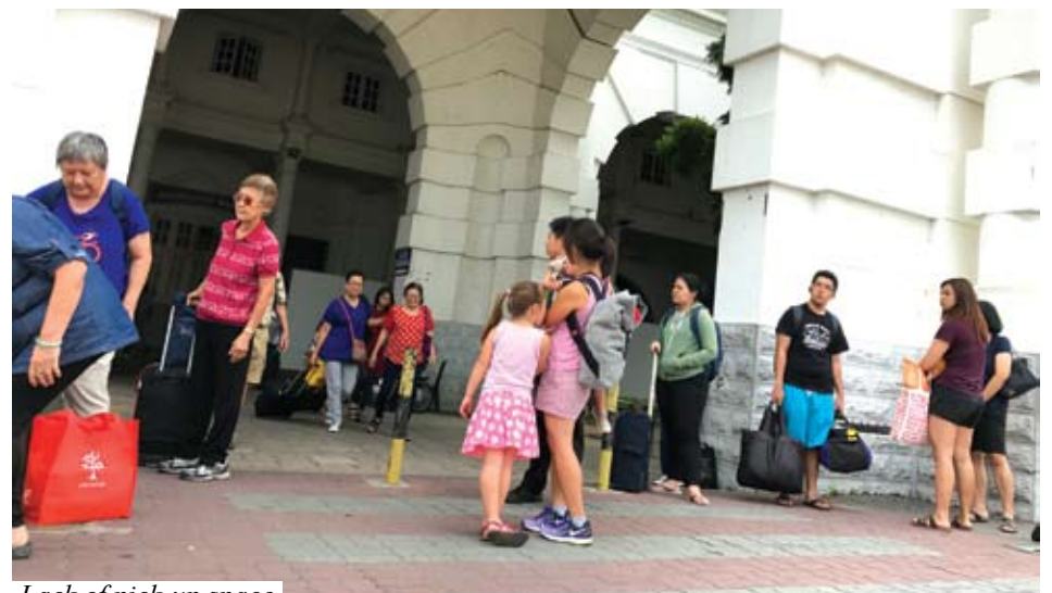
Lack of pick-up space