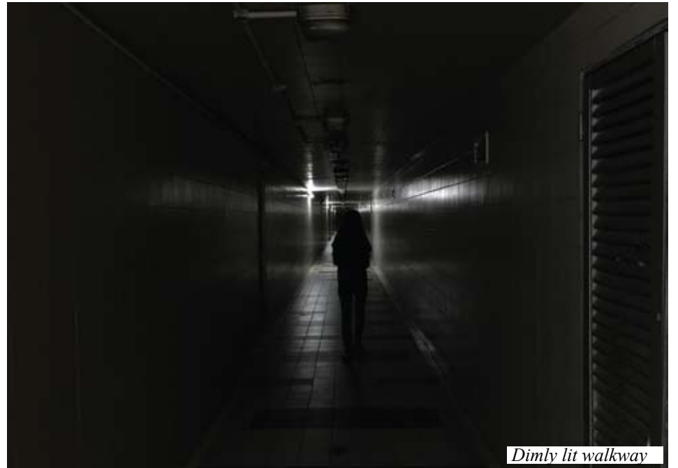
Dimly lit walkway