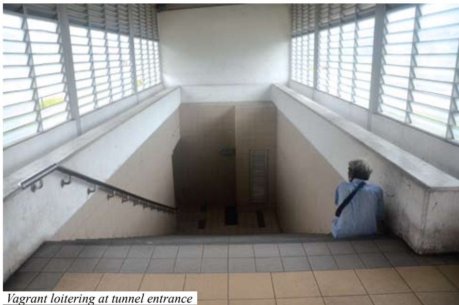
Vagrant loitering at tunnel entrance

“We’ve minor and major maintenance works for the escalators. For minor issues, we’ve maintenance crew to check but for major issues, our appointed contractors will do the repair works,” he added.