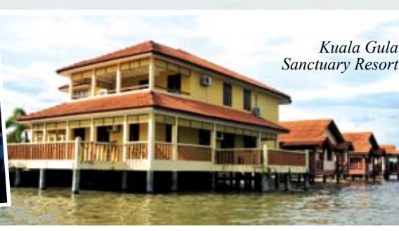
Kuala Gula Sanctuary Resort