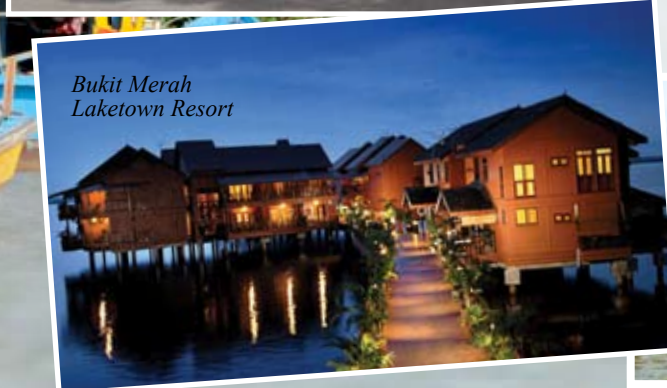
Bukit Merah Laketown Resort