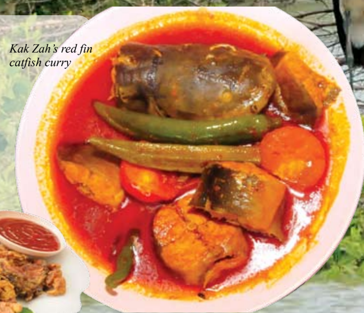
Kak Zah's red fin catfish curry

Kuala Gula Sanctuary Resort's Restoran Cenderawasih also serves one of the best kari ikan sembilang, but the restaurant is also known for its mouth-watering deep-fried soft shell crabs.