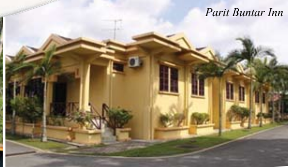
Parit Buntar Inn

Parit Buntar Inn Add: No. 1, Jalan Pejabat, 34000 Parit Buntar, Perak. Tel: +605-7173160 / +605-7176750 Fax: +605-7175100 GPS Coordinates: N 05° 07.877' E100° 29.351'