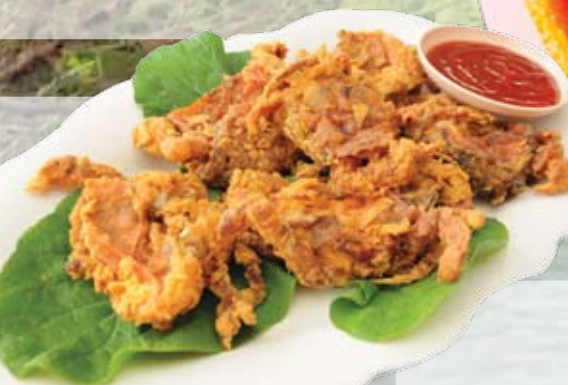
deep-fried soft shell crabs

Kuala Gula Sanctuary Resort's Restoran Cenderawasih also serves one of the best kari ikan sembilang, but the restaurant is also known for its mouth-watering deep-fried soft shell crabs.