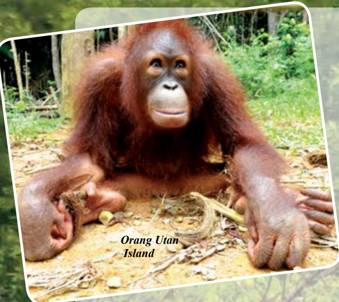
Orang Utan Island

Orang Utan Island (OUI) is about 15 minutes by boat from Bukit Merah Lake-town Resort. The Bukit Merah Orang Utan Island Foundation is located on this tiny island on the lake. The foundation conducts conservation, infant care, education and research programmes on Orang Utan. OUI is the only ex-situ conservatory of its kind in Malaysia, where primates are conserved, cared for, rehabilitated and then released to their natural habitats when the animals are ready to be independent. There are only two Orang Utan species in the world. Those at OUI are of the Pongo pygmaeus (Borneo) species. It is a protected animal under Malaysian wildlife laws. Although OUI is open to the public, visitors are only allowed visual contact. There are boat trips at 30-minute intervals. However, the island may be closed at certain periods of the year due to low water level in the lake.