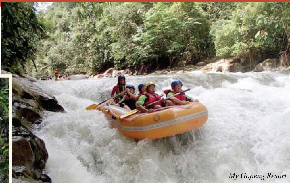
My Gopeng Resort

Extreme-based activities are the craze for the young-at-heart, the not-so-young and those wishing to spice up their lives with a little adrenaline rush. To cater to this growing demand, centres offering physically-challenging activities, such as abseiling, caving, canoeing, jungle trekking et. al., have mushroomed at the city fringes. This scribe went on an inspection of these places to unravel the attractions that have many daredevils clamouring for more. Take a deep breath and let us dive into the extreme!