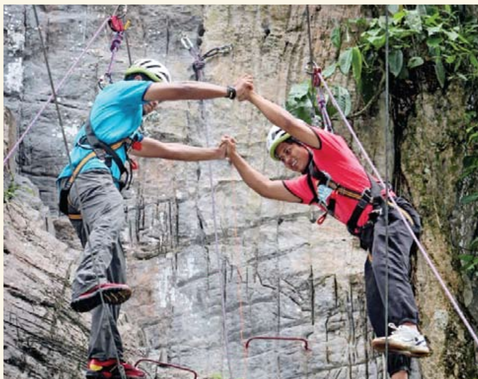
Wild Woosey (Lost World of Tambun)