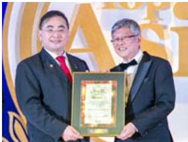
Malaysia's Top 10 Outstanding Property Developers Award 2014 with YB Datuk Ir. Dr. Wee Ka Siong Minister in Prime Minister's Department

There never has been nor will there ever be! Our intent will always be to preserve the environment We are merry without the fireworks