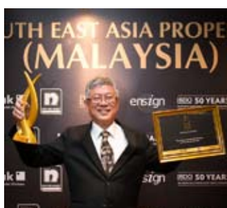
Best Green Development 2014 (Malaysia)