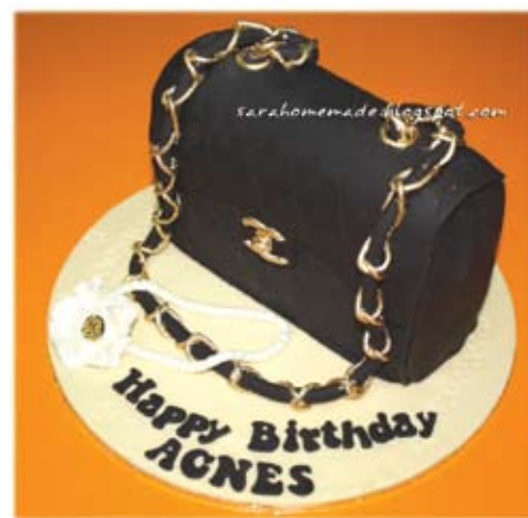
Sarah's branded bag cake