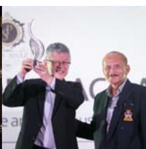
Eco Developer of the Year 2013 (Malaysia)