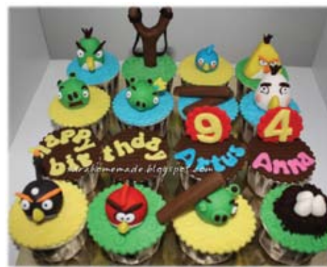
Sarah's Angry bird cupcakes