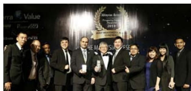
Best Managed Condo-Resort 2014 (Malaysia)