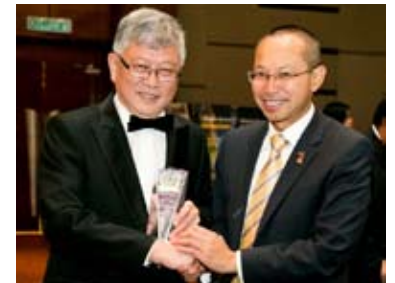
Malaysia's Best High-Rise Residential Development 2014 with YB Dato Seri Abdul Wahid Omar, Minister in The Prime Minister's Department

There never has been nor will there ever be! Our intent will always be to preserve the environment We are merry without the fireworks