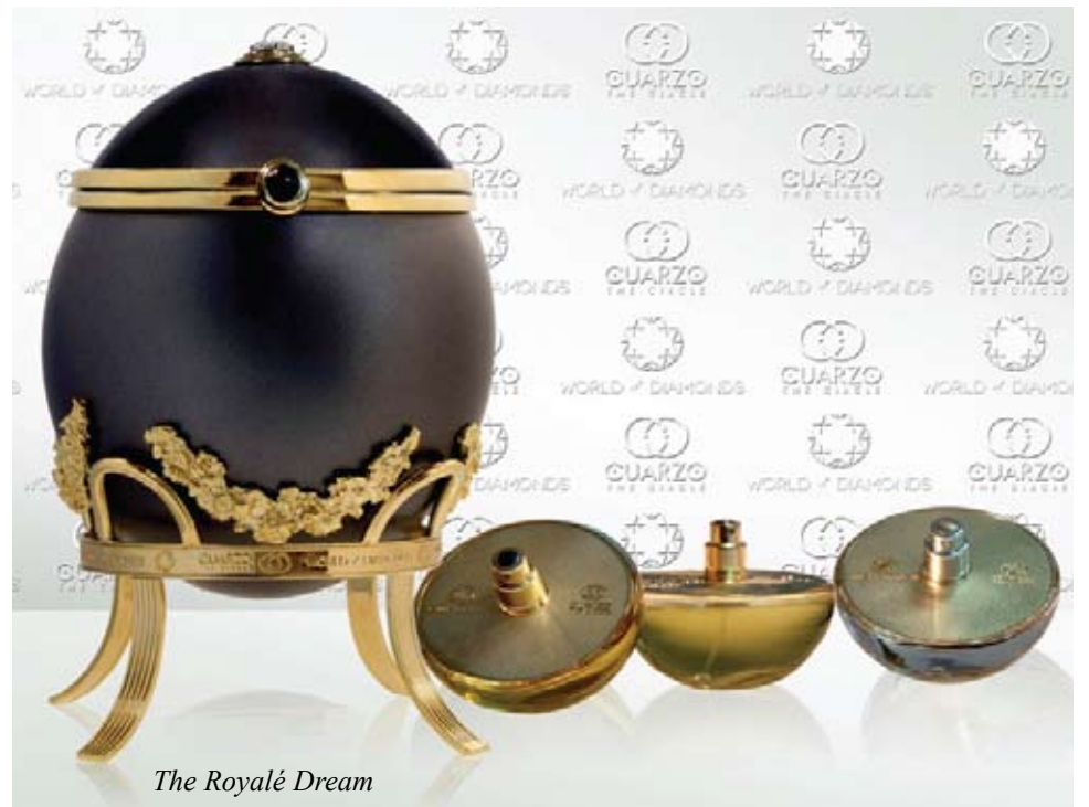
The Royalé Dream

Besides adorning the Chi Chi von Tang models in over $10 Million USD worth of glittering masterpiece diamonds, the second-to-none evening also saw the debut of The Royalé Dream , one of the world's most expensive fragrances with a price tag of S$190,000 that was bought by a VIP Amber Lounge client at the end of night!