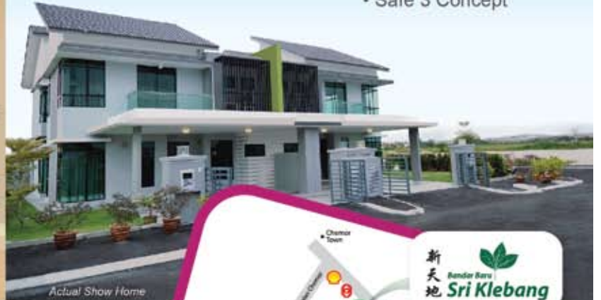
Actual Show Home

Show Homes Open daily from 10a.m. - 6p.m.