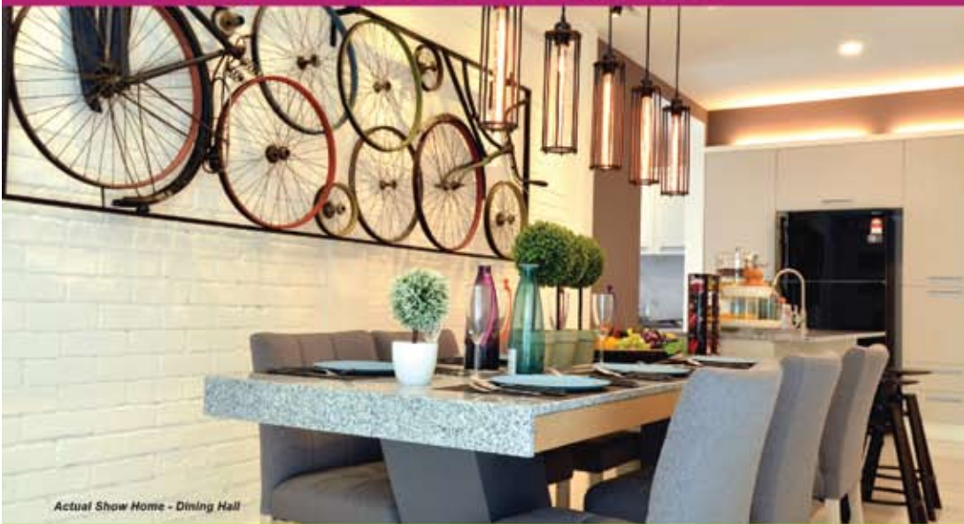
Actual Show Home - Dining Hall

5% discount for bumiputera on bumiputera lot