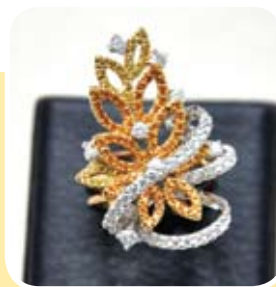
Flower motif Yellow Sapphire (with toning) & Diamond Ring. Specially marked down price for sale

converting from their home currency. These are prices which they would never find back home with a quality that is unbeatable.