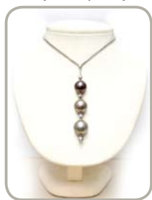
Pendant set with Tahitian Pearls and Diamonds. Specially marked down price for sale

As life is for celebrating, what better way to raise your joie de vivre than to treat yourself to a bling bauble or two while taking advantage of this annual affair at Adris Jewellers where GIA certified diamonds, pearls and pearl jewellery as well as their own in-house brand of fine jewellery and jewellery for everyday wear are offered at marked down prices, some even going at below cost .