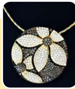
Two-tone Diamond & Brown Diamond Designer Pendant