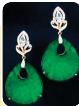
Pair of exclusive jadeite Earrings

Visitors and expats living here may also wish to take advantage of these offers which are simply too irresistible, not to mention the fantastic value they'd be getting when