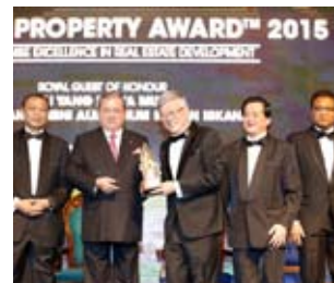
WINNER - FIABCI-MALAYSIA PROPERTY AWARD '15