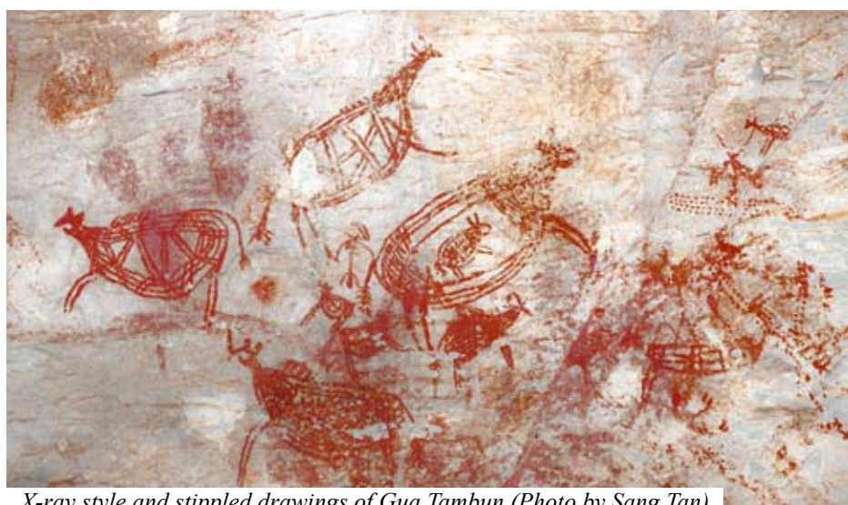
X-ray style and stippled drawings of Gua Tambun