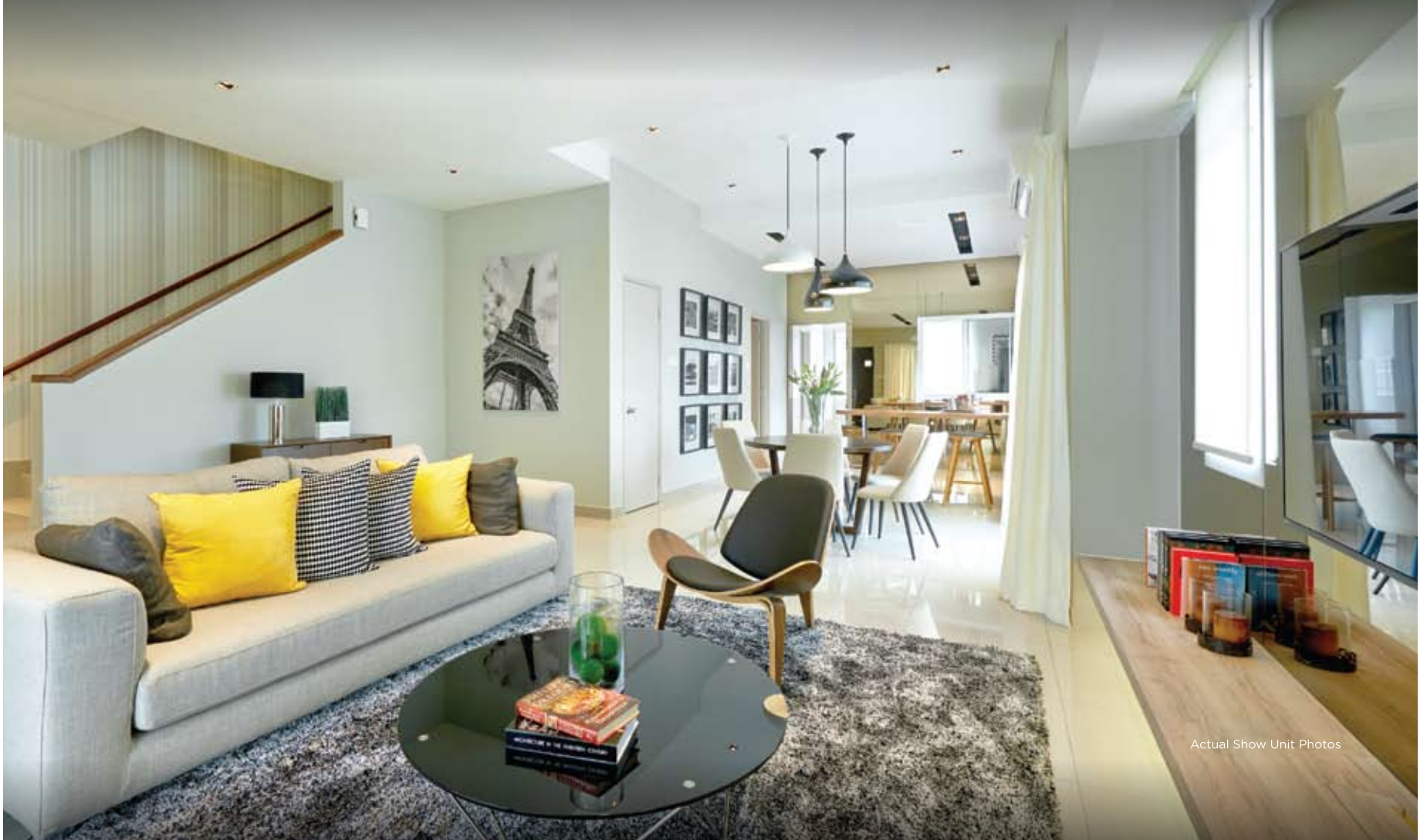
Actual Show Unit Photos

Thrive At The Heart Of All That Matters To You