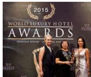
GLOBAL WINNER - WORLD LUXURY HOTEL AWARDS '15

AND WINNER ASIA CONTINENT - BEST SCENIC HOTEL