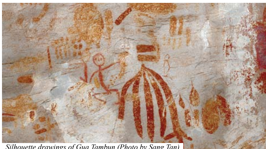
Silhouette drawings of Gua Tambun