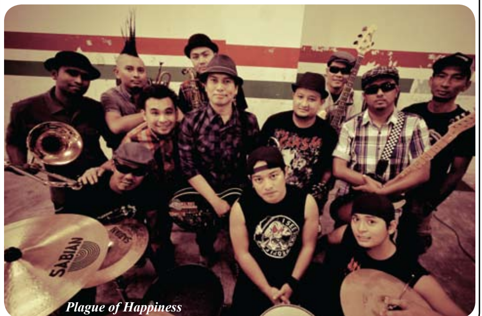
Plague of Happiness