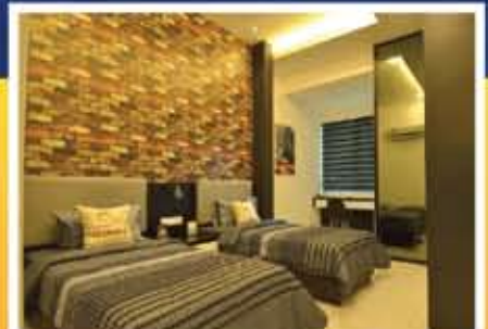
Actual Show Home Interior Illustrations