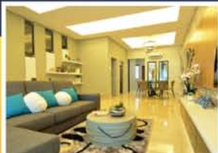
Actual Show Home