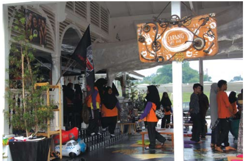
Sarang Art Hub

Location: Sarang Art Hub, Jalan Rumah Rehat, Taman Bandar, 35900 Tanjung Malim, Perak.