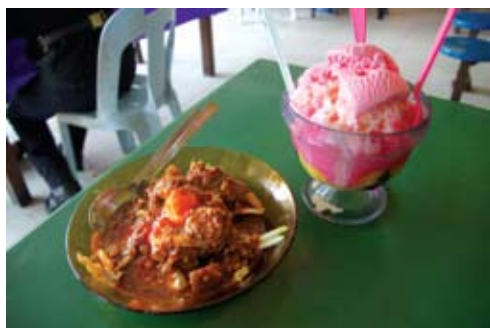
Aman Gado Gado