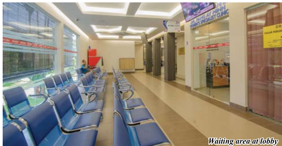
Waiting area at lobby