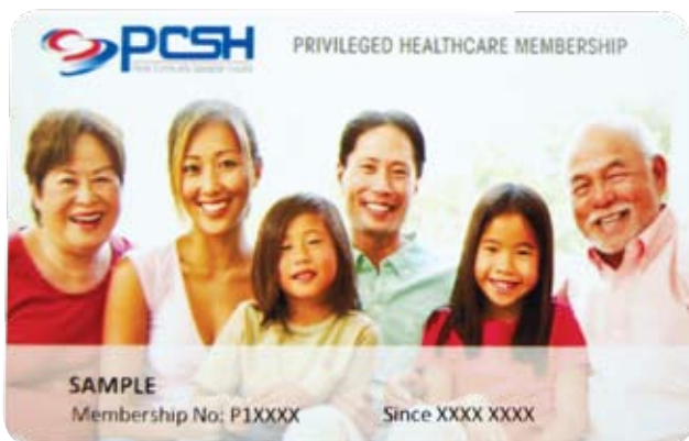
Privilege Healthcare Membership Card