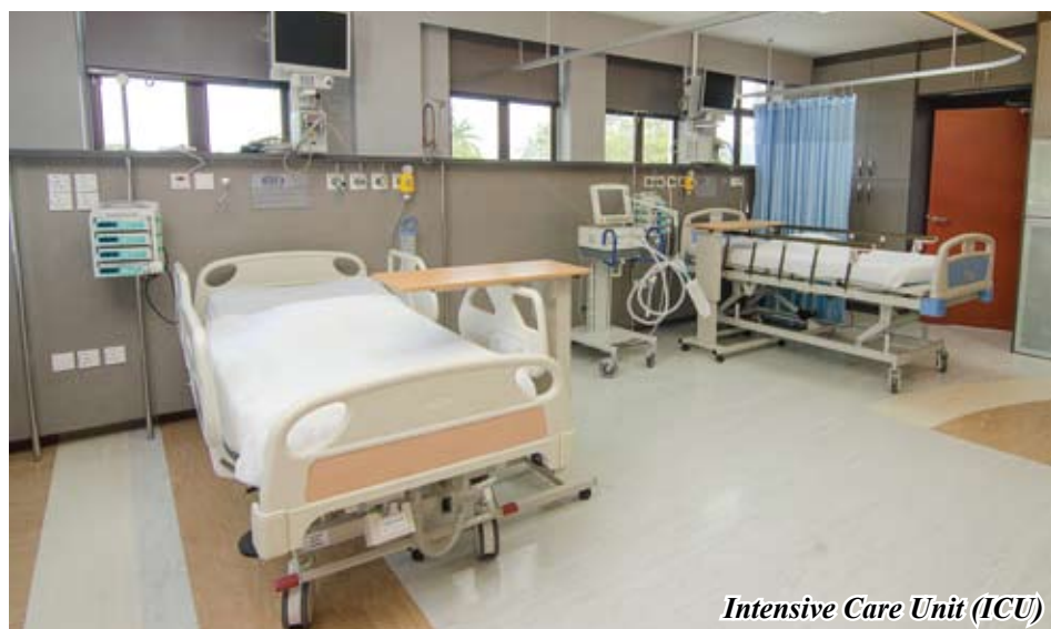
Intensive Care Unit (ICU)

The hospital has been transformed into a modern facility through a few phases of renovation in recent years.