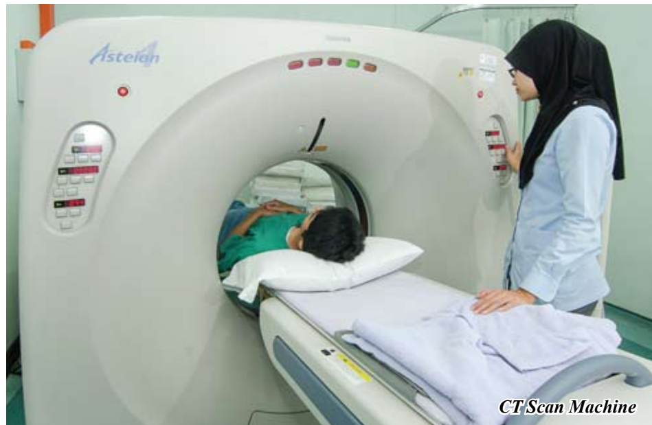
CT Scan Machine

This 76-bed multi-disciplinary hospital, served by the team of dedicated resident consultants, continues to offer affordable health care services supported by modern technologies. Currently the hospital houses fourteen resident consultants, four medical officers and four sessional consultants. A full list of the consultants can be found on page 6 in this issue.