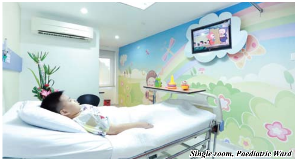
Single room, Paediatric Ward

According to the Ministry of Health (MOH) Malaysia's health facts report in 2015, more than one million patients were admitted to private hospitals in 2014. Ipoh prides itself on having quite a number of private hospitals with one especially known for its affordable health care – the Perak Community Specialist Hospital . Many patients whether cash paying or covered by insurance medical cards recognize that its medical bills are both reasonable and affordable. It is also preferred by many because of its ample parking space and easy access to the various facilities in the hospital.