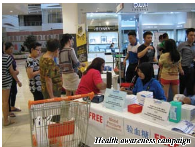
Health awareness campaign

Recently for the convenience of the community, PCSH has adopted two bus stops in front of the hospital, constructed and maintained them; and now they have the first bus stops in Ipoh which are lighted at night.