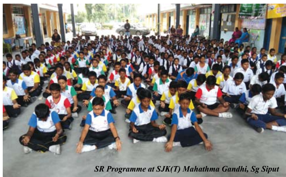
SR Programme at SJK(T) Mahathma Gandhi, Sg Siput