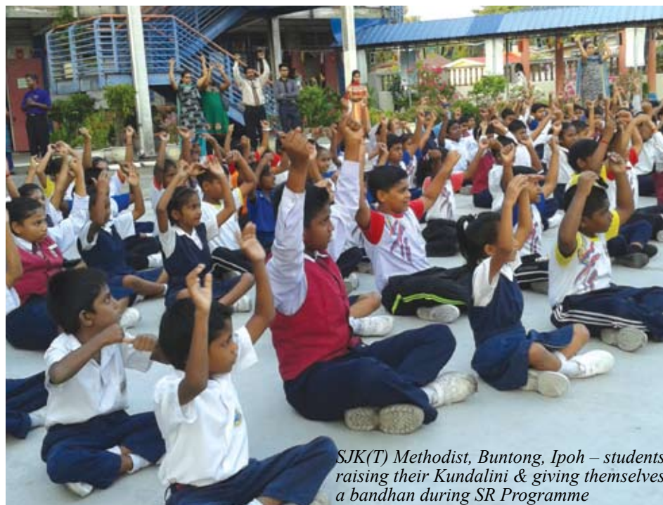
SJK(T) Methodist, Buntong, Ipoh – students raising their Kundalini & giving themselves a bandhan during SR Programme