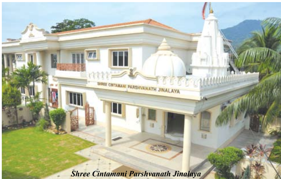
Shree Cintamani Parshvanath Jinalaya