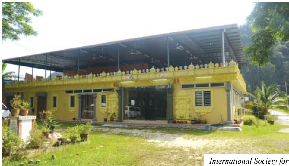
International Society for Krishna Consciousness