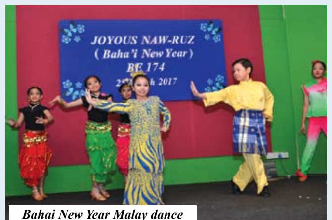
Bahai New Year Malay dance