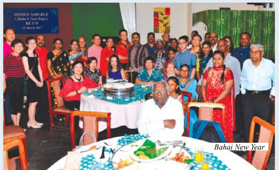
Bahai New Year