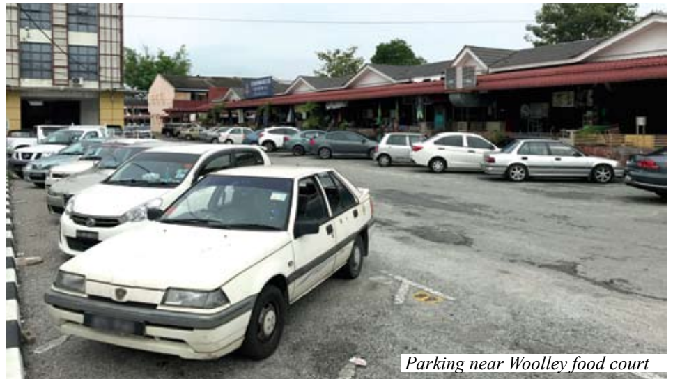
Parking near Woolley food court

safety measures at the park. Despite the park being a popular spot with Ipohites, the police beat at the park is seldom manned and the CCTV cameras are non-functional," she bemoaned.