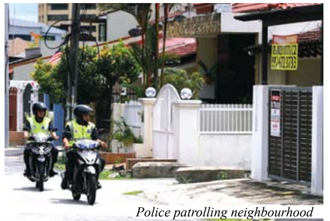
Police patrolling neighbourhood

Her car battery was stolen some time ago when she stopped by the Woolley food court.