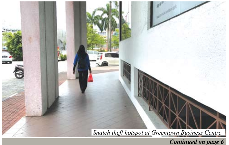
Snatch theft hotspot at Greentown Business Centre