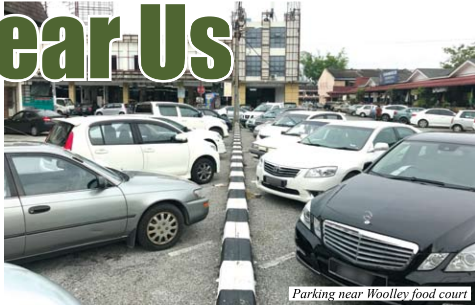
Parking near Woolley food court