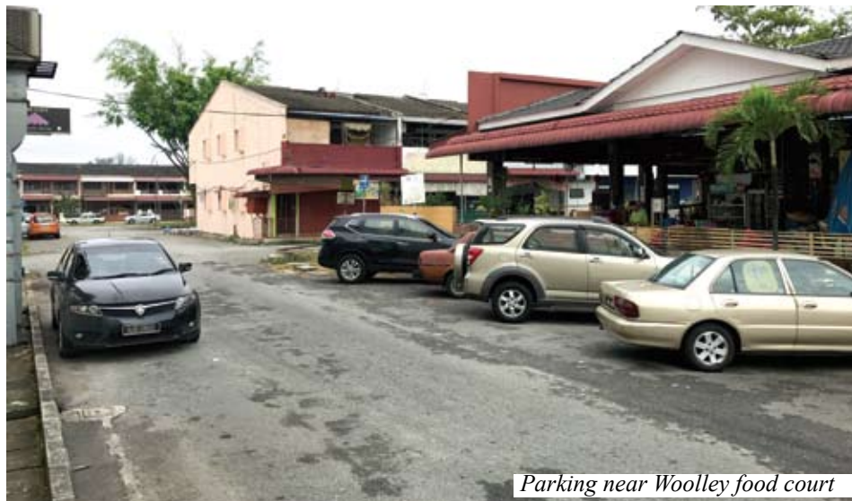
Parking near Woolley food court

the attention of passers-by. Never try to chase the culprits alone because they might harm you.