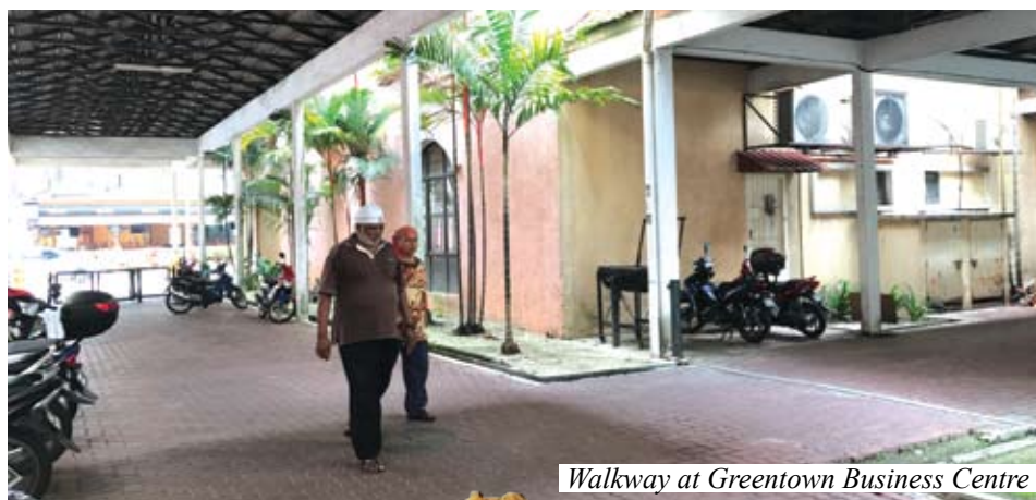
Walkway at Greentown Business Centre