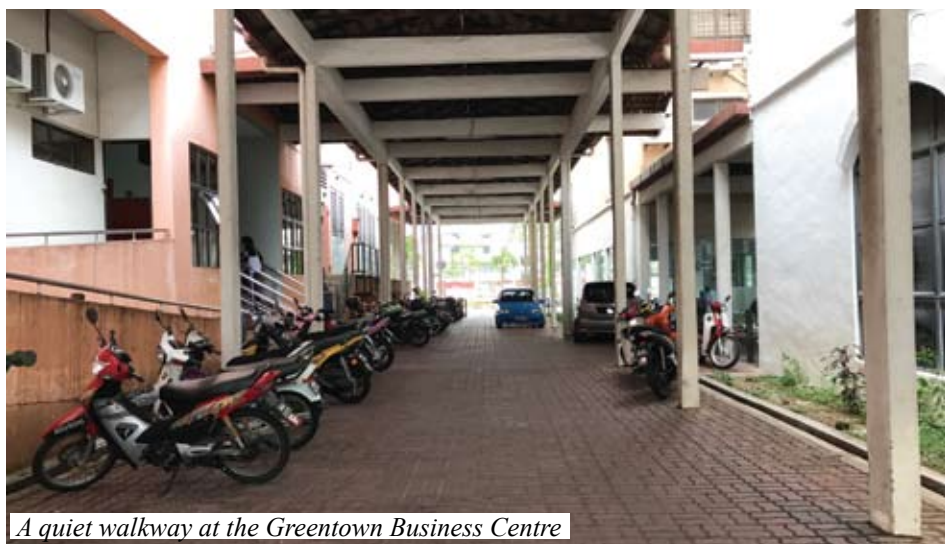
A quiet walkway at the Greentown Business Centre