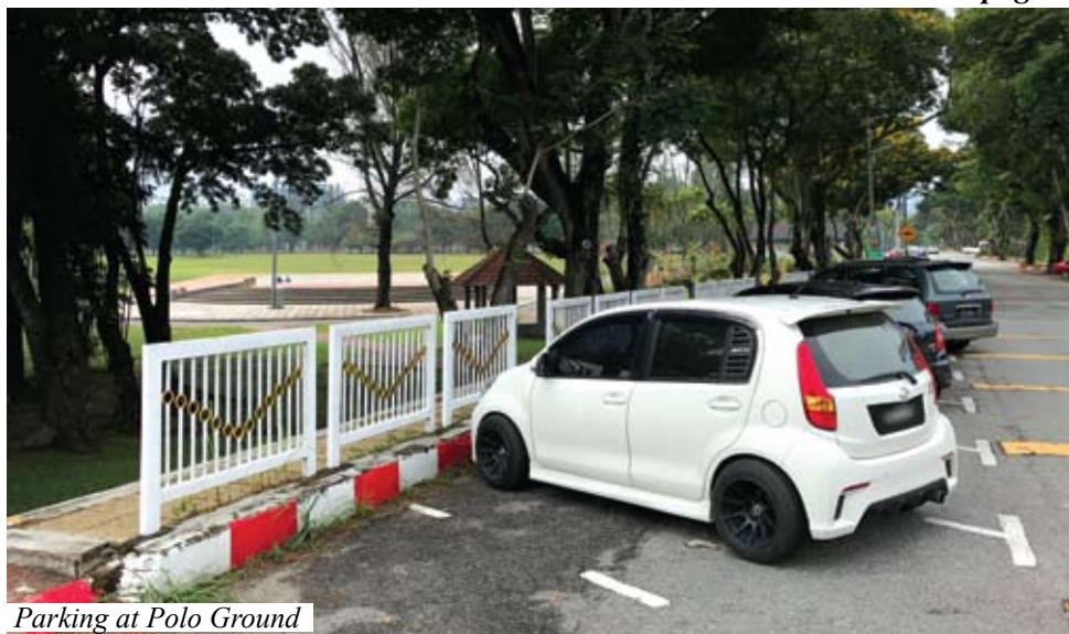
Parking at Polo Ground