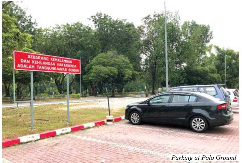
Parking at Polo Ground