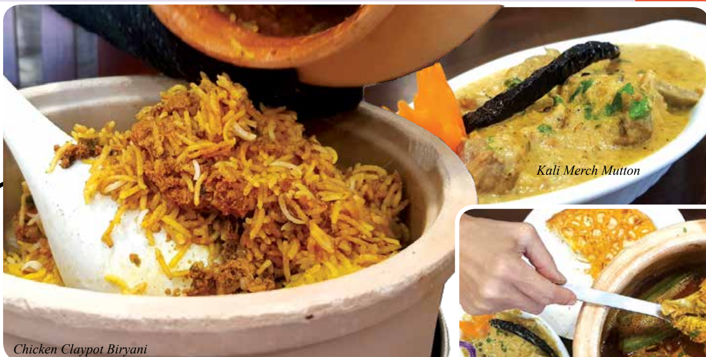
Chicken Claypot Biryani