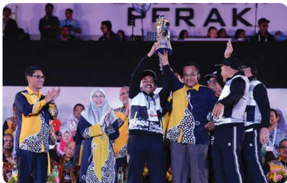
Terengganu is the overall SUKMA XIX champion