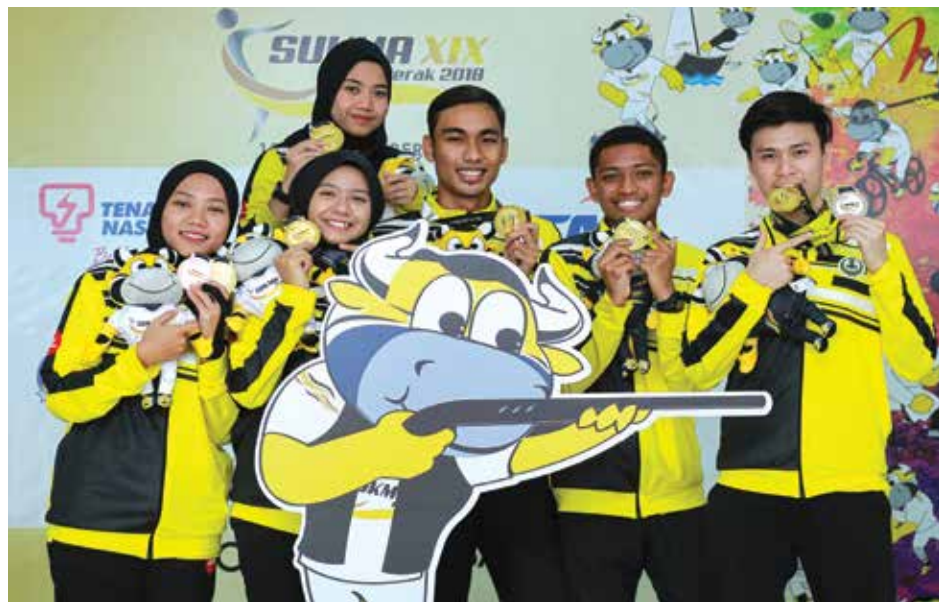
Perak's shooting team with their gold medals

Compared to SUKMA 2016 when it won 12 gold, 26 silver and 34 bronze, host Perak has definitely improved although it fell short of the 50 gold medals target.