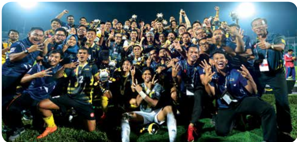
Perak's football team celebrates their win

Present were guest-of-honour, Deputy Prime Minister Dr Wan Azizah Wan Ismail, Menteri Besar Ahmad Faizal Azumu, Minister of Youth and Sports Syed Saddiq bin Syed Abdul Rahman, Human Resources Minister M. Kulasegaran and other dignitaries.