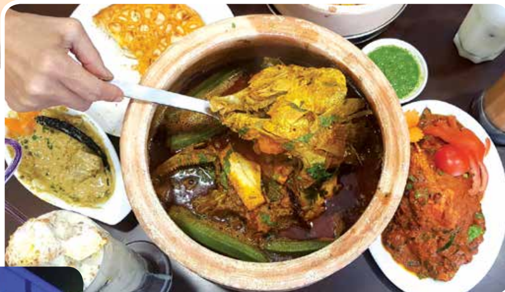
Kali Merch Mutton

And then to the Curry Fish Head , a dish that is getting harder to find these days, at least the ones with the right kind of fish. This the Garupa head, and not the other varieties more commonly available and not as tasty. Here the fish head comes in various sizes ranging in price from RM68-RM98 . We had the small one which was adequate for our group of 4. The sauce was tangy without being overly spiced and had the usual