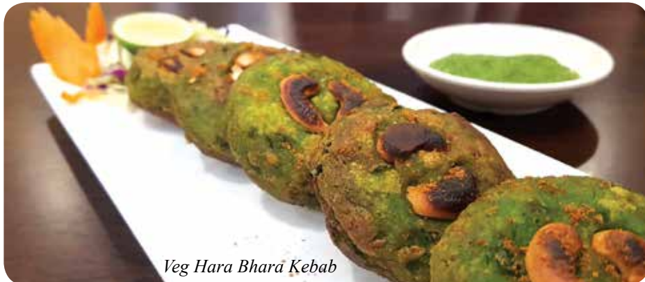
Veg Hara Bhara Kebab