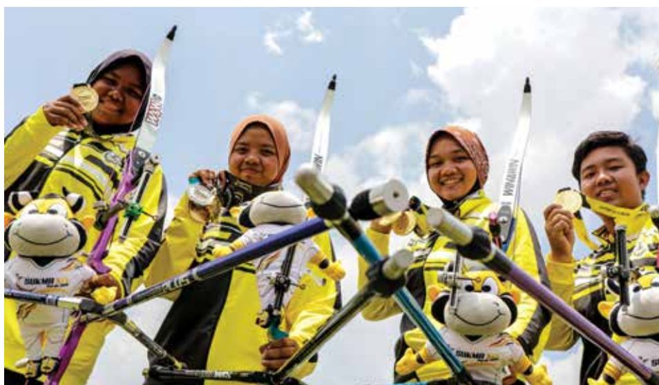
Perak's women's archery team with their gold medals