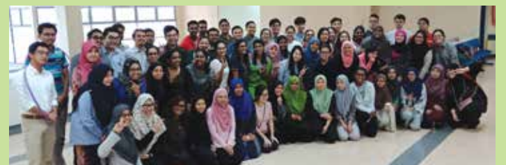
House officers at the coaching session in the "House Officers essential skills workshop"