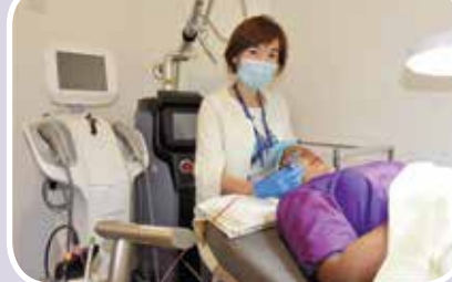
Using HIFU on a patient.

If drooping and sagging is very pronounced, before considering a facelift, there is also the option for the Thread Lift , using serrated threads which are inserted in strategic areas that lift up sagging skin. Again, this is a procedure that will last a maximum of 2 years.