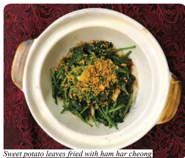
Sweet potato leaves fried with ham har cheong

We followed this with the sweet potato leaves fried with ham har cheong or preserved prawn paste – the Chinese variety and not our sambal belacan; RM8/12/16 .