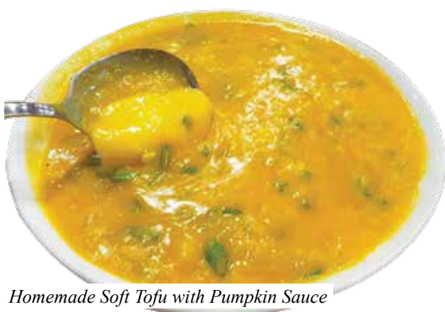
Homemade Soft Tofu with Pumpkin Sauce

Another signature dish next, the Homemade Soft Tofu , steamed and topped with a smooth pumpkin/seafood sauce laced with small prawns and salted egg yolk. The combination was velvety, umami and slurp-worthy, RM10/15/20 .