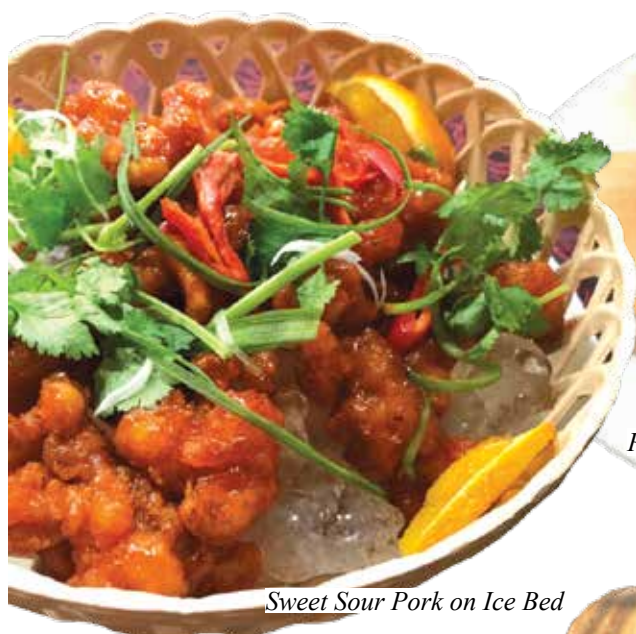
Sweet Sour Pork on Ice Bed