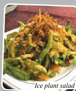
Ice plant salad

No. 11 & 13, Laluan Perusahaan Menglembu 2, Kawasan Perusahaan Menglembu, 31450 Menglembu, Perak. Tel: 012-475 7513 Business hours: 11.30am to 2.30pm; 6pm to 10.30pm (daily) Off 1 weekday every 2 weeks (not fixed)