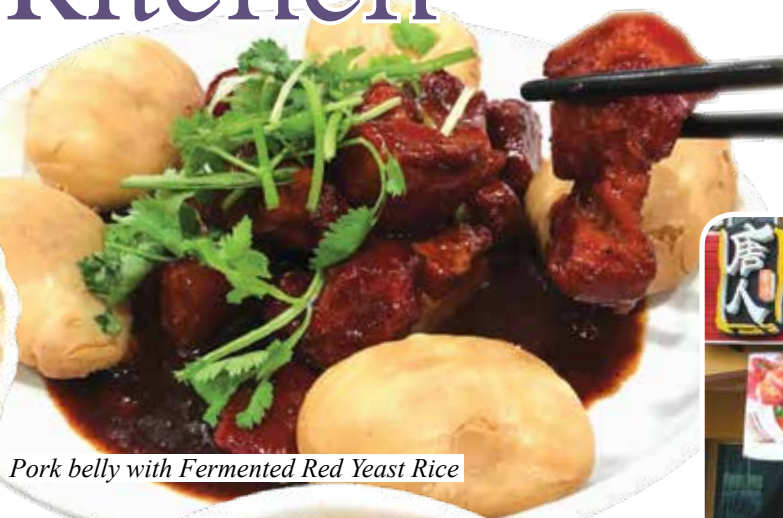
Pork belly with Fermented Red Yeast Rice