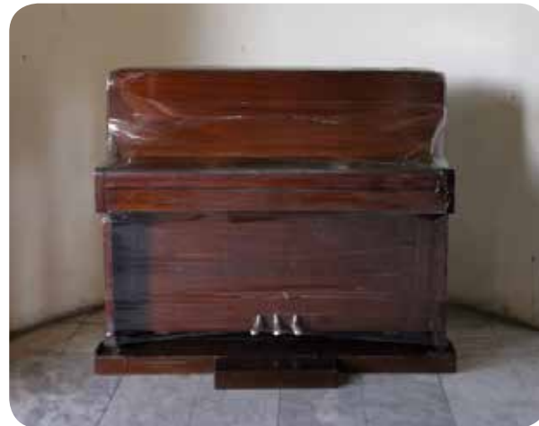
Pride of place in Main Convent.