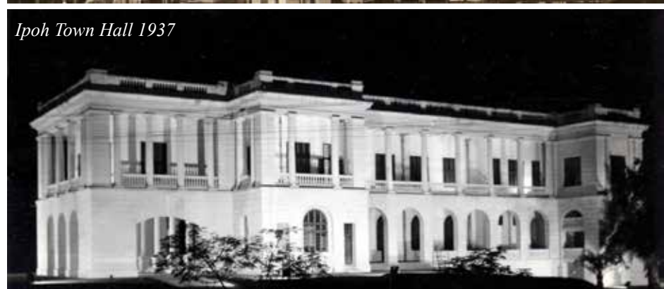
Ipoh Town Hall 1937