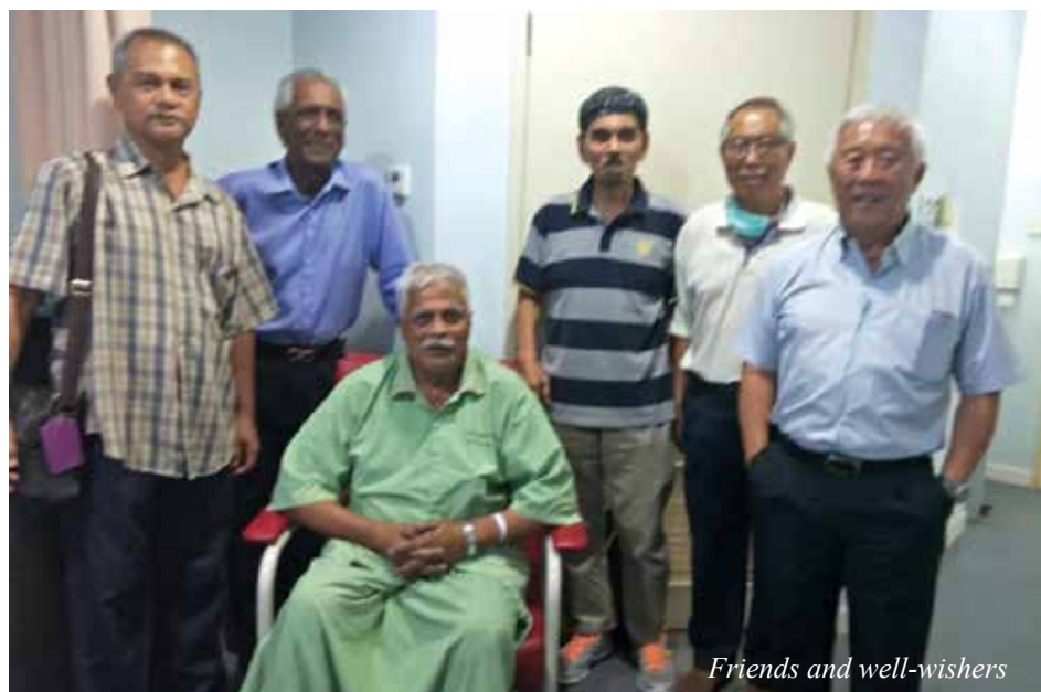
Friends and well-wishers

I was under the illusion that the military does not care for its members when they are out in the cold. I was proven wrong.