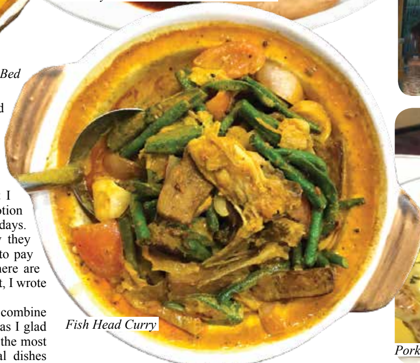
Fish Head Curry

The Fish Head Curry arrived. This is the pièce de