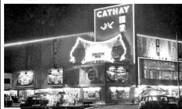
Cathay Theatre, Ipoh Grand Opening 1958

At one time Ipoh had around 11 cinemas and although several specialised in one language or type of movie, nonetheless competition was the keyword. Theatres like the Lido and Majestic would put on stage shows, competitions and promotions to stay in the public spotlight. Against this background, the Cathay Theatre opened in Ipoh on February 17, 1958, the eve of Chinese New Year.