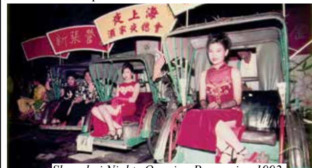
Shanghai Nights Opening Procession 1992

Today, like many of the movie theatres, the building lies empty – a memorial to the days when peanuts, sunflower seeds and kacang putih were all part of the entertainment scene. At least they still stand, as part of our built heritage, although how much longer they will survive it is not possible to forecast.