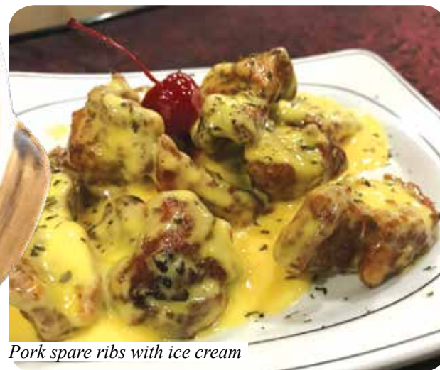
Pork spare ribs with ice cream