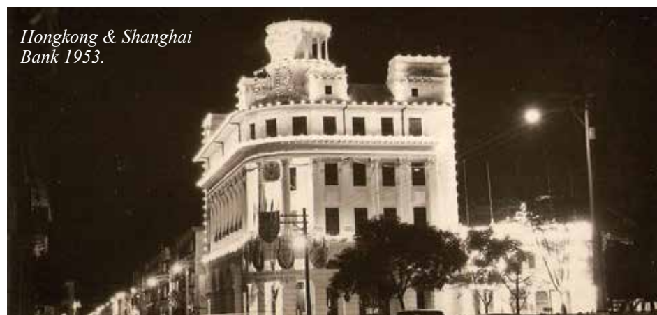
Hongkong & Shanghai Bank 1953.

Merdeka was 62 years ago and yet, apart from the old single-screen cinemas, which announced their existence with a myriad of lights, until they were forced into redundancy by the mighty Multiplexes, there have been no more occasions where our city has practised the architecture of the night. Sure, there are still small pockets of light around our city at night, but nothing to compare with the floodlit brilliance and splendour of those special occasions that the older generation can still remember, as if it was only yesterday.