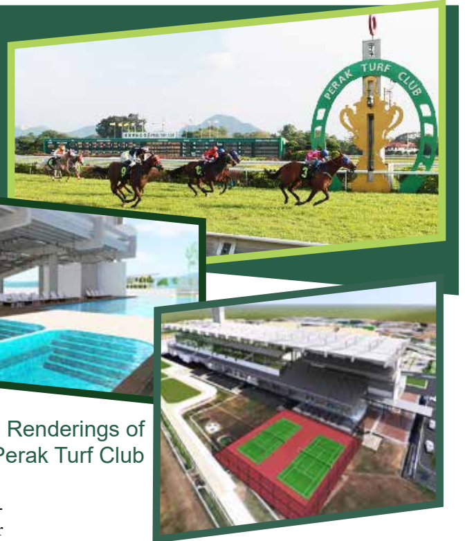
Architectural Renderings of the New Perak Turf Club

Preserving the club's rich heritage is paramount. The design of the new facilities prioritizes seamless integration with the club's historical charm, ensuring that the legacy of the Perak Turf Club is not only preserved but also celebrated as we move forward.