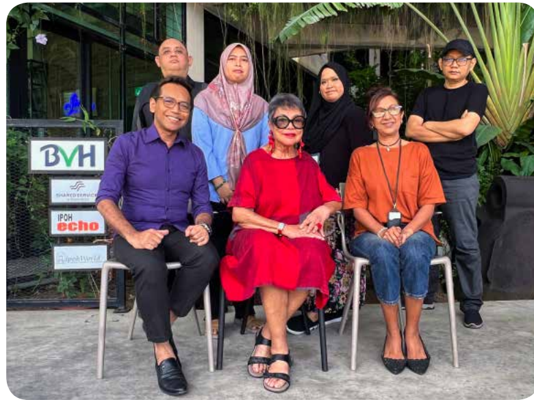
Ipoh Echo's Editorial Team

The combined portals have attracted a diverse audience across communities and age groups with their varied reports.